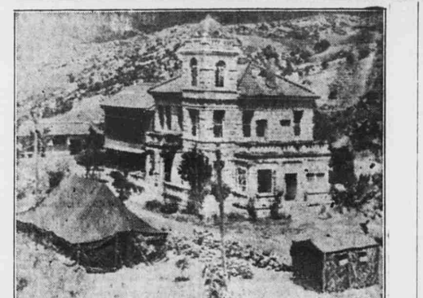
KOREAN RESISTANCE SITE —In this building that looks like a suburban American residence of the early 1900s delegates of the United Nations were called to confer with Communists in trying to arrange a cease-fire armistice. This is a radio photo.

15 Years Ago August 7, 1936 Anchored at St. Joseph's Central Dock is the world's oldest ship and the last of a long line of hulks once used in transporting thousands of convicts—and women—from England to penal colonies in far-off Australia. The convict ship "Success" was built in 1790. These boats were known as "Ocean Hell's"