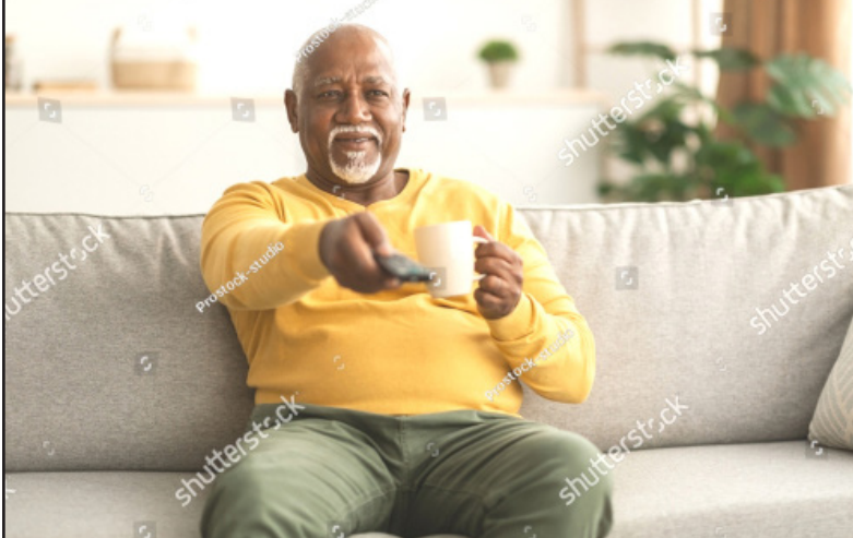
ተረፍ ፋርማሊ 4ርምሊ ሓዳሽ ዘመን 4ርምሊ ግድብ ሓዳሽ 4ርምሊ ክተደረሑ

እዩም ተመራመርቲ ብዘይገኘ ስራሕ ዝገበኹ ግዜም ኮይኑ ኣለዎ ዘኸልፍዎ ልዑላ. 60 ዓመት ዝወደመ ሰባት ሰባት ብምጽር እቲ ኮይኑ ዝወደመ ግደታት ሰባት፡ ስምም ልዑላ ኮምፕዩተር ዘለዎም ተክሎ እውን ዝደገፍ ምዃኑ ሓቢሩ፡፡