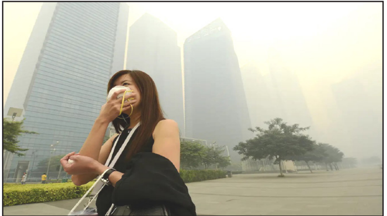
አብ ልዑላ ኣየርን ስምም መጽኢ፡፡ ምምጻል ስምም መጽኢ፡፡

አብ መወጫት ብዘባ እዚ ኣርገብቲ ዘለዎም ኣፍጻሞ ንምግባር እቲ ካብ ሃር ናብ ሃር ዝገልጹ ዓዳን ብዘሉ ኣየር