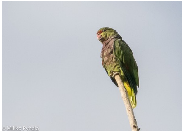
Photo below left Vinaceous-breasted Amazon photo right White-throated Hummingbird

Vinaceous-breasted Amazon Amazona vinacea ENDEMIC VULNERABLE CdJ, Estrada do Horto a few perched in tall Araucarias before dusk