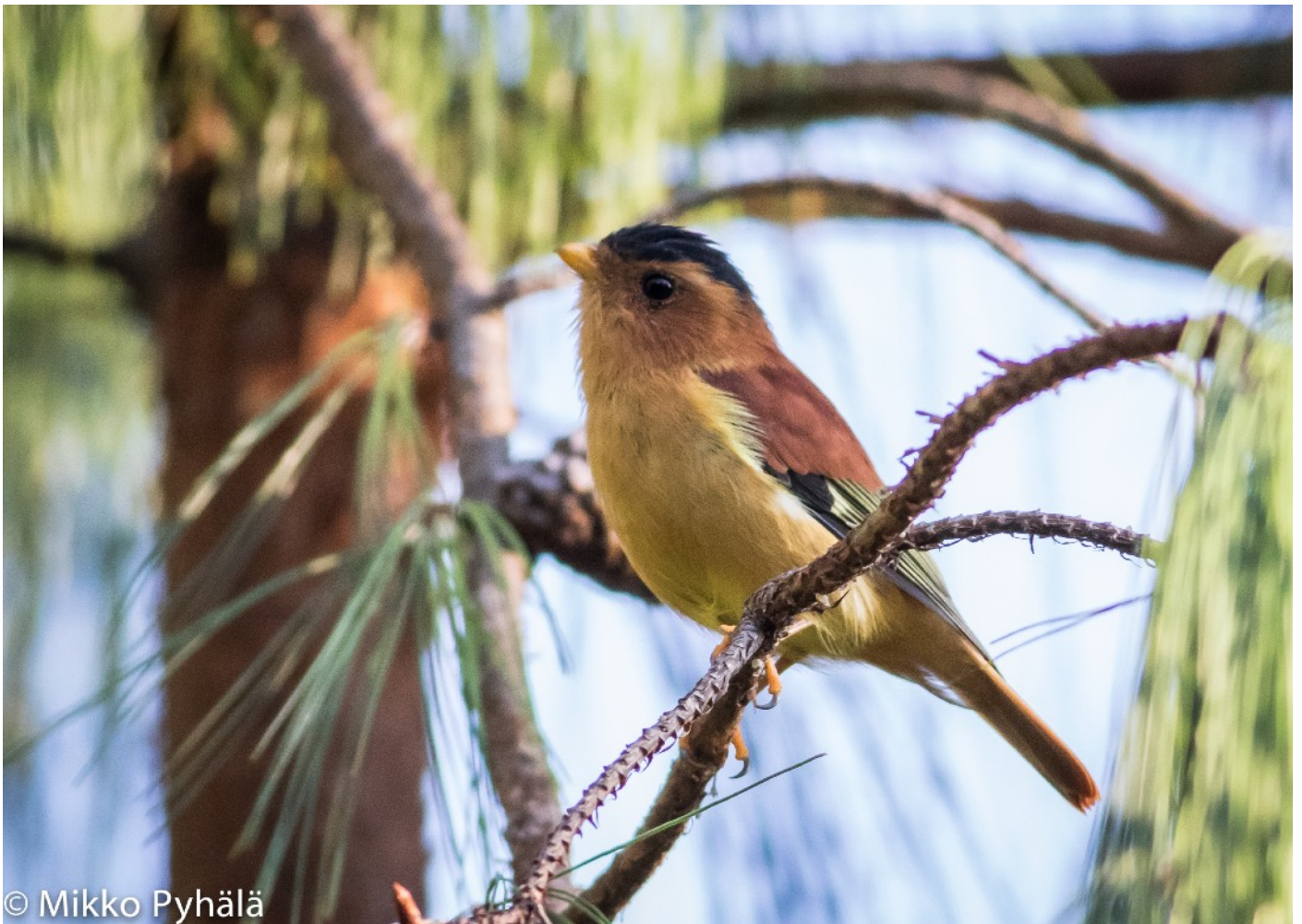
Photo below: Black-capped Piprites is one of the spectacular Araucaria specialists