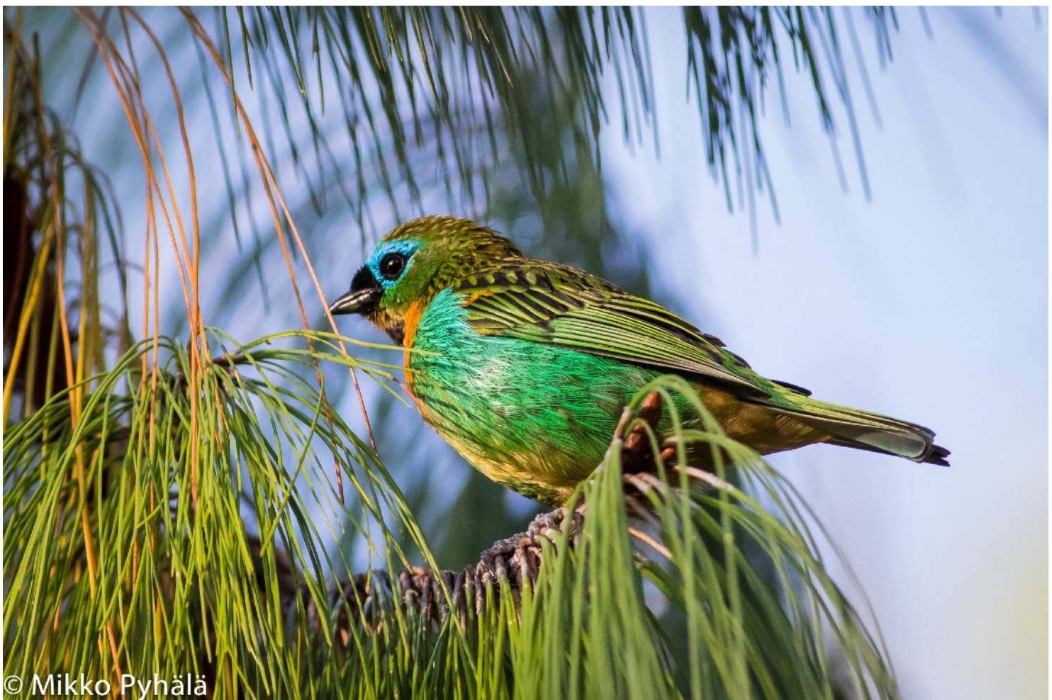
Photo: Bassy-breasted Tanager, one of the most beautiful birds of the highlands

Among the events of greatest impact were two very short morning walks from Villa Hegus with Carlos when we stayed at a group of flowering and fruiting small trees which attracted up to some hundreds of birds of a few dozen species, including a large flock of the unbelievably beautiful Brassy-breasted Tanagers . With us standing still, the birds were feeding calmly a few meters from us allowing close observation and photography. One of the finest birds seen was Black-capped Piprites which is a relative of the Manakins. A flock of rarely observed Swallow-tailed Cotingas landed in a tall pine just in front of us. Thanks to Carlos' expertise, I could see and photograph several other Araucaria specialists such as Araucaria Tit-spinetail , White-throated Hummingbird , Green-crowned Plovercrest , Surucua Trogon , Scalloped Woodcreeper , Serra do Mar Tyrannulet , Serra do Mar Tyrant-manakin , Diademed Tanager , Rufous Gnatcatcher , Golden-winged Cacique , Bay-chested Warbling-finch , Buff-breasted Warbling-finch and White-rimmed Warbler . Also a visit to a lek of Blue Manakin was memorable. Rufous-tailed Anthrush we only heard, could not see.