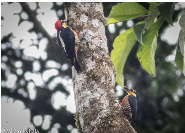
Photo below left Yellow-fronted Woodpecker Photo below right White Woodpecker

White Woodpecker Melanerpes candidus Tremembé, gregarious and noisy- Yellow-fronted Woodpecker Melanerpes flavifrons Indaiatiba one noisy pair in courtship.