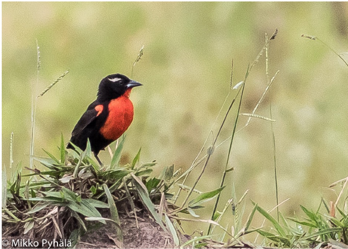
Upper: White-Browed Blackbird male; lower: Chestnut-capped Blackbird subadult male