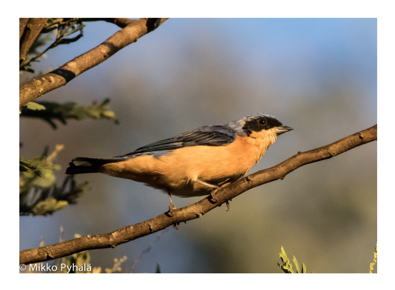
below Fawn-breasted Tanager