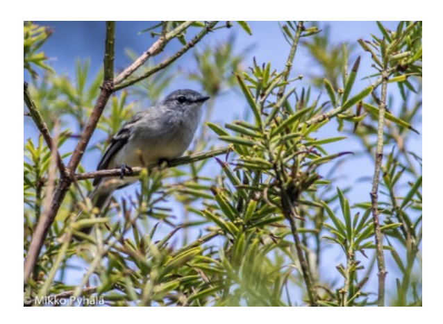
Grey-capped Tyrannulet Phyllomyias griseocapilla ENDEMIC CdJ, Estrada do Horto, several heard and seen. Photo above left, note typical yellow flanks Southern Beardless Tyrannulet Camptostoma obsoletus obsoletum CdJ common in the region

Grey Elaenia Myiopagis caniceps Indaiatiba one foraging, calling and seen