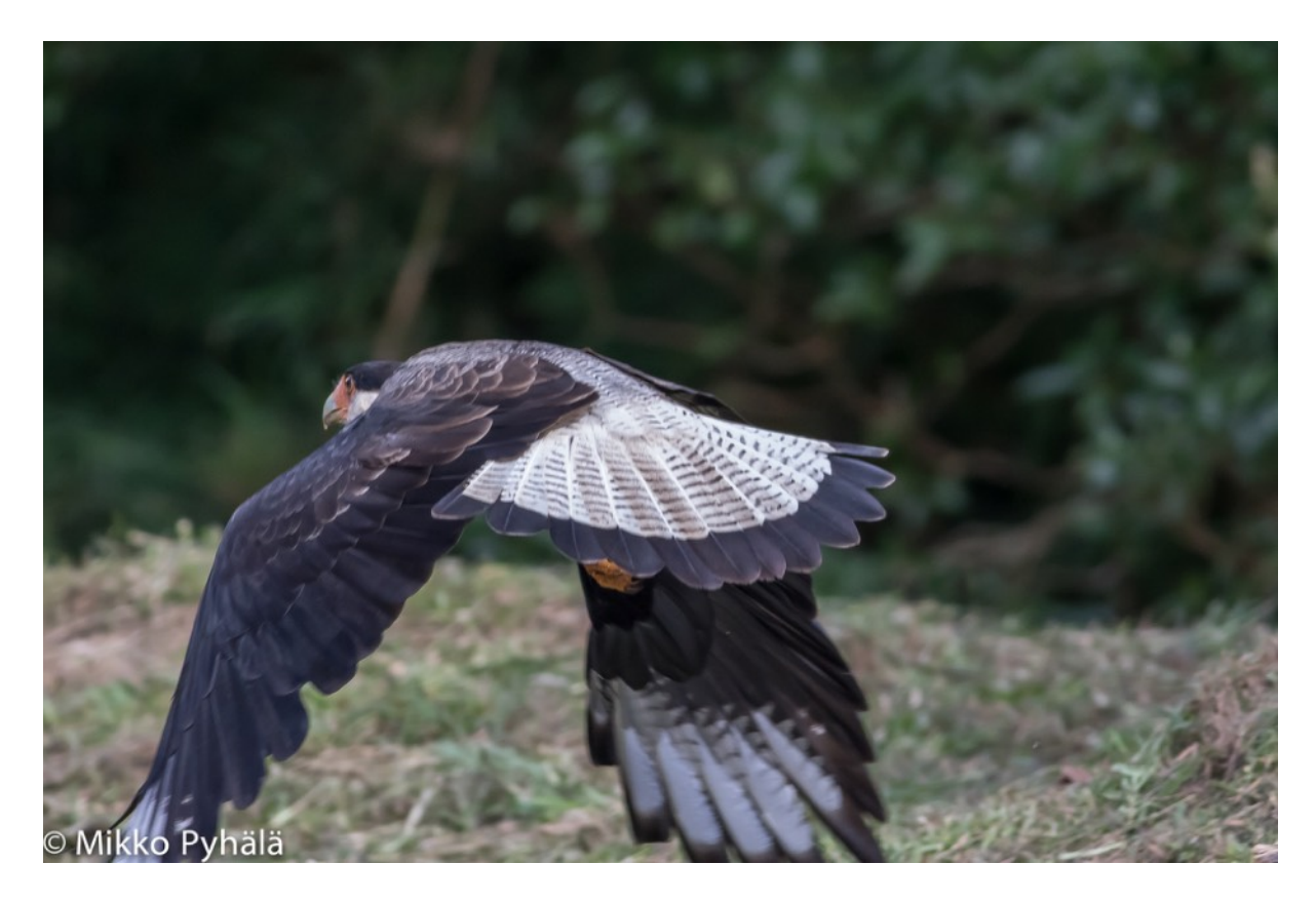
Above Southern Caracara,