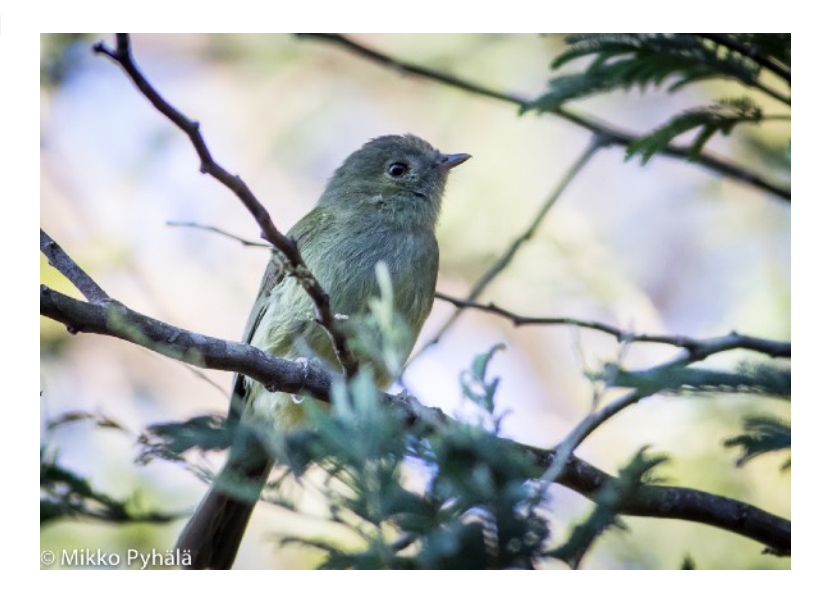
Photo right: Serra do Mar Tyrantmanakin, also Araucaria apecialist

Some 70 of my bird pictures of this trip have been uploaded on Internet Bird Collection with precise indication of the location. Those you can look up under my IBC profile https://www.hbw.com/ibc/u/3849.