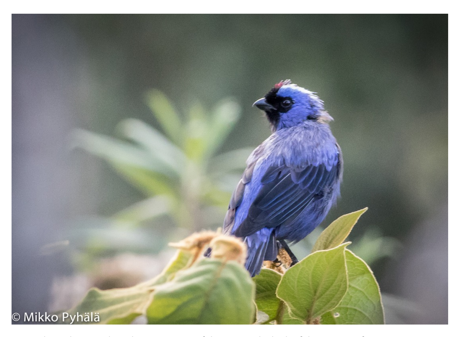
Photo above: Diademed Tanager is one of the spectacular birds of the Araucaria forests

are indicated in bold. I did not much try to see birds quite familiar for me which we only heard, even if a different subspecies. The list of threatened birds used here is the 2014