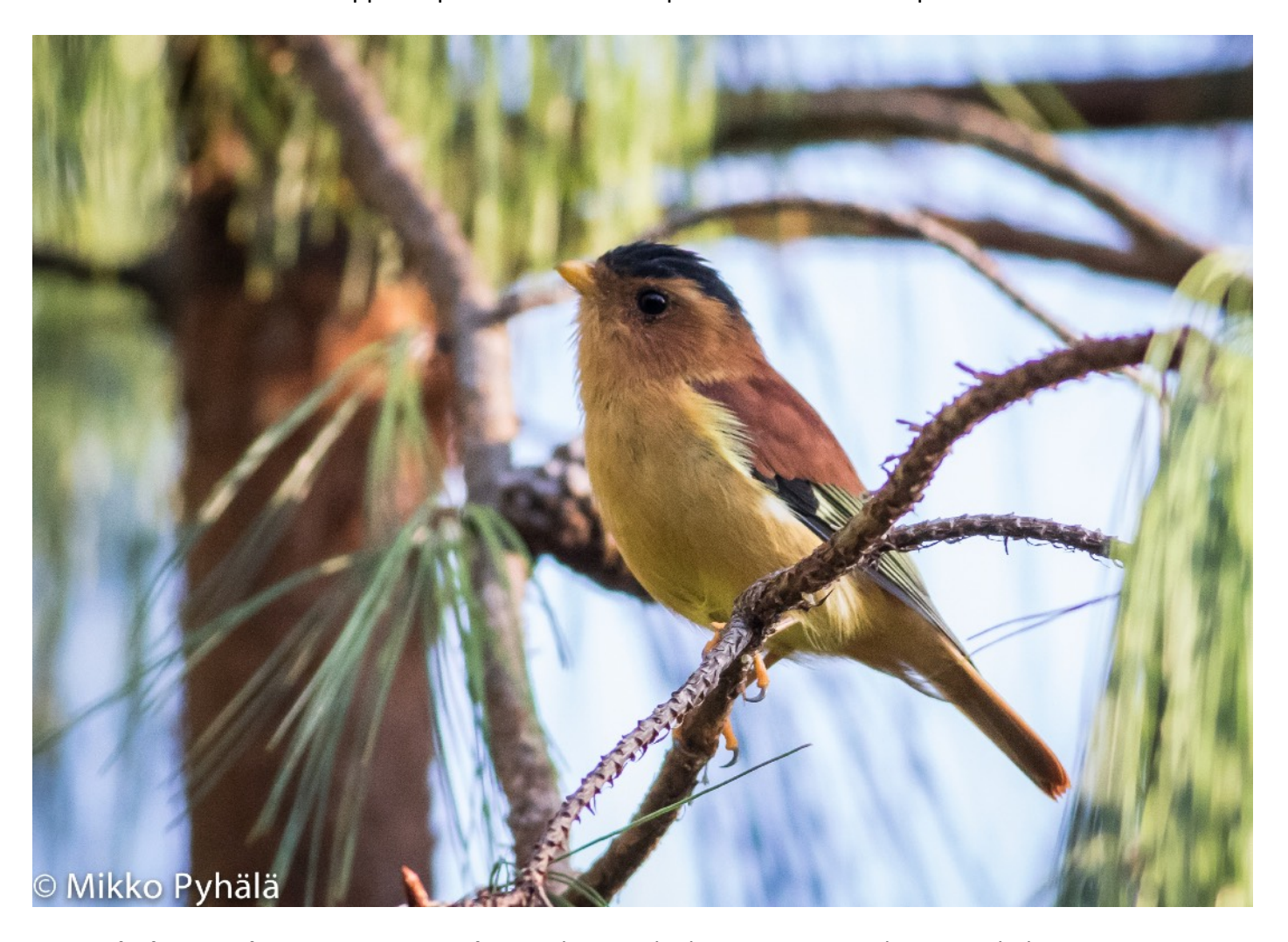
Photo below: Black-capped Piprites is one of the spectacular Araucaria specialists

Black-capped Piprites Piprites pileata CdJ, Estrada do Horto. One male responded extremely well to playback near our hotel