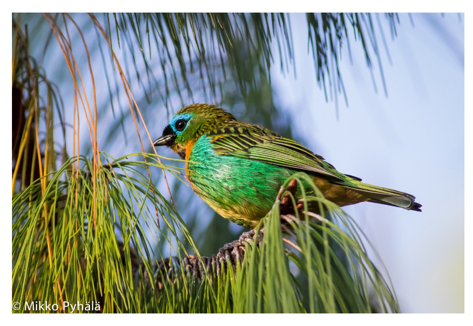
Photo: Bazzy-breasted Tanager, one of the most beautiful birds of the highlands

Among the events of greatest impact were two very short morning walks from Villa Hegus with Carlos when we stayed at a group of flowering and fruiting small trees which attracted up to some hundreds of birds of a few dozen species, including a large flock of the unbelievably beautiful Brassy-breasted Tanagers. With us standing still, the birds were feeding calmly a few meters from us allowing close observation and photography. One of the finest birds seen was Black-capped Piprites which is a relative of the Manakins. A flock of rarely observed Swallow-tailed Cotingas landed in a tall pine just in front of us. Thanks to Carlos' expertise, I could see and photograph several other Araucaria specialists such as Araucaria Tit-spinetail, White-throated Hummingbird, Green-crowned Plovercrest, Surucua Trogon, Scalloped Woodcreeper, Serra do Mar Tyrannulet, Serra do Mar Tyrantmanakin, Diademed Tanager, Rufous Gnatcatcher, Golden-winged Cacique, Bay-chested Warbling-finch, Buff-breasted Warbling-finch and White-rimmed Warbler. Also a visit to a lek of Blue Manakin was memorable. Rufous-tailed Antthrush we only heard, could not see.