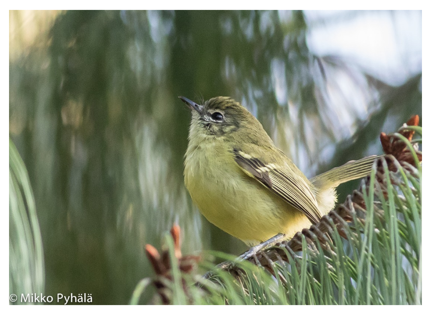
Photo above: Mottle-cheeked Tyrannulet, tail typically cocked. Photo right: Robust Woodpecker

Several species which the literature indicates of being lower altitude birds, have actually been recorded normally in this area in the past. Such species are e.g. Greenish Warbler, White-throated Hummingbird, Bay-chested Warbling-finch, and to some extent Crested Black-tyrant.