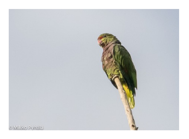
Photo below left Vinaceous-breasted Amazon photo right White-throated Hummingbird

Vinaceous-breasted Amazon Amazona vinacea ENDEMIC VULNERABLE CdJ, Estrada do Horto a few perched in tall Araucarias before dusk