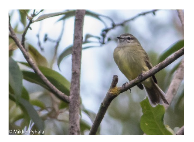
Greenish Tyrannulet Phyllomyias virescens CdJ, Pico do Itapeva, Estrada do Horto, several Planalto Tyrannulet Phyllomyias fasciatus brevirostris CdJ, Pico do Itapeva, Estrada do Horto, strada da Pedra do Baú, widely spread and vocal