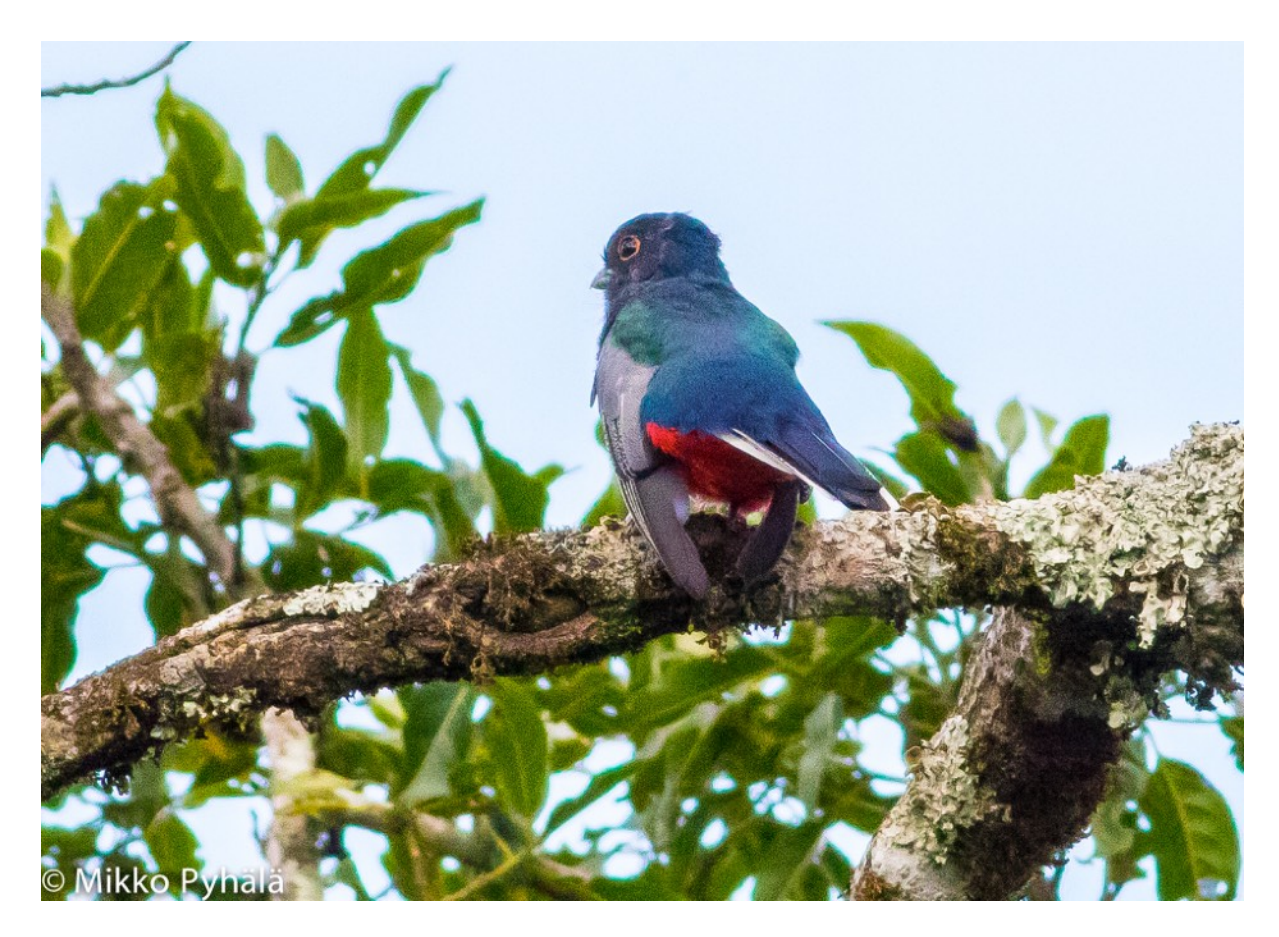
Photo above: Southern Surucua Trogon, identified by bright red belly and yellow eye Red-breasted Toucan Ramphastos dicolorus CdJ, Pico do Itapeva, in pairs or small groups Channel-billed Toucan Ramphastos vitellinus Rio, two seen and heard calling after 6 a.m. at distance

Toco Toucan Ramphastos toco CdJ, Indaiatiba, flew over when leaving Sao Paulo White-barred Piculet Picumnus cirratus CdJ, Estrada da Pedra do Baú, Tremembé, Rio. Most commonly seen/heard woodpecker