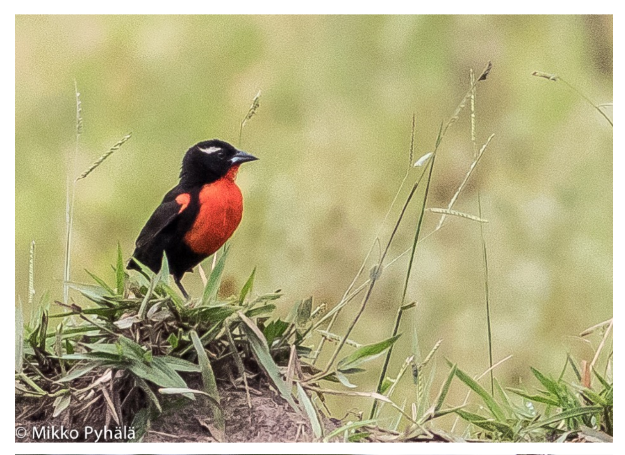
Upper: White-Browed Blackbird male; lower: Chestnut-capped Blackbird subadult male