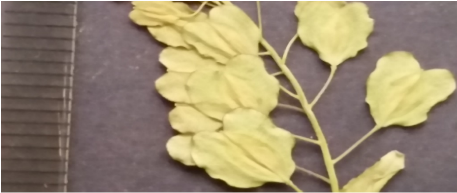
Figure 8. Thlaspi kilicii , infructescence, Ş. Yıldırımılı 41211 & Ö. Kılıç (holotype)