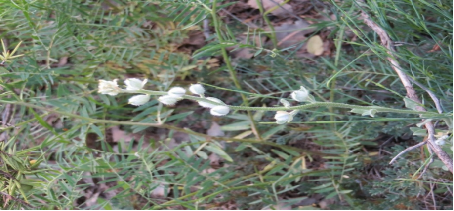
Figure 3. Fibigia yildirimlii , habitus, Ş. Yıldırımli 41058 & Ö. Kılıç (holotype)