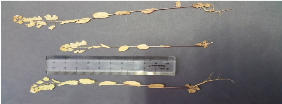
Figure 6. Thlaspi kilicii , habitus, Ş. Yıldırımli 41211 & Ö. Kılıç (holotype)

Eponymy. The new species is named in honour of Doç. Dr. Ömer Kılıç, Bingöl University, Bingöl, Turkey.