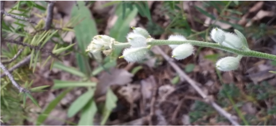
Figure 4. Fibigia yildirimlii , infrutescence, Ş. Yıldırımli 41058 & Ö. Kılıç (holotype)