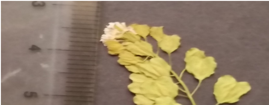
Figure 7. Thlaspi kilicii , inflorescence, Ş. Yıldırımli 41211 & Ö. Kılıç (holotype)