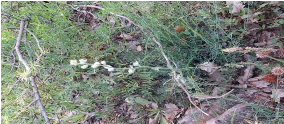
Figure 2. Fibigia yildirimlii , habitus, Ş. Yıldırımli 41058 & Ö. Kılıç (holotype)