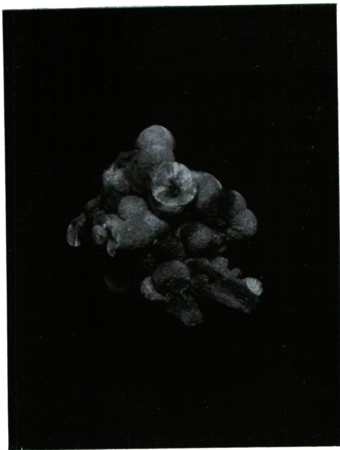
Fig. 2. Globular-radial aggregates of felsőbányaite. 2\times natural size.