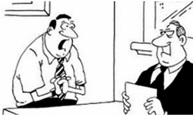
If you’re trying to force people to retire when you think they’re no longer “productive,” shouldn’t you have left many years ago?