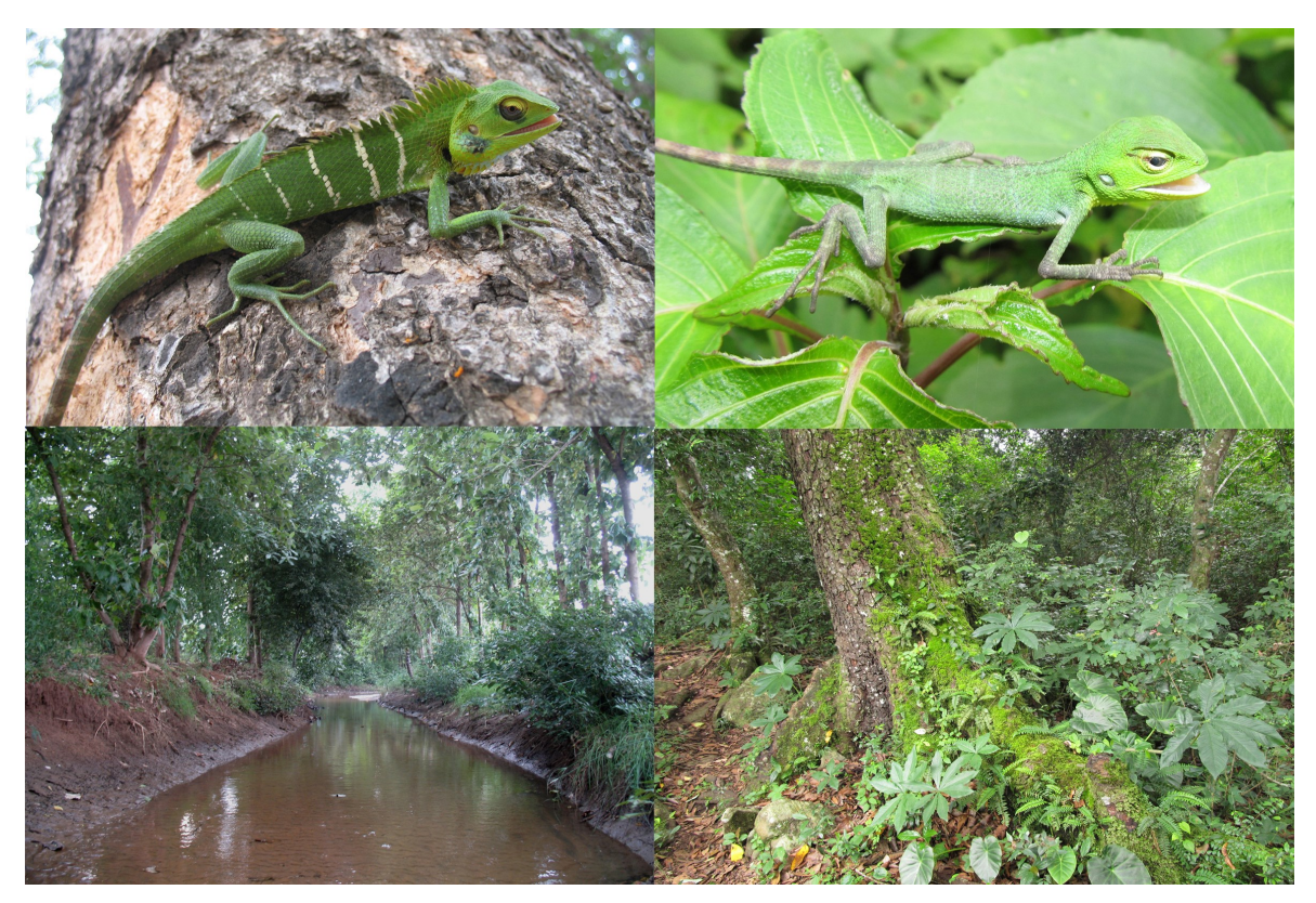
Figure 3. Adult and juvenile colouration (top panel) of Calotes calotes and the respective habitat profiles (bottom panel) from Mayiladuthurai (Cauvery Basin) and Kolli hills (Eastern Ghats)

scales; 4<sup>th</sup> toe subdigital lamellae 29–30; labial scales 9– 12 on upper and lower lips; overall colouration verdant grass green in life turning to dark grey in preservation, with 5 or 6 off-white cross bars across trunk and anterior part of tail, this pattern being obscure or absent in young ones and subadults; eye with a brick red ocular streak, ashy grey in preservation; tail ending brownish grey; ventral, gular and subcaudal regions fluorescent green in life, ashy grey in preservation. Measurements in mm: snout to vent length 80-120; tail length 320-390; head length 22-33; head width 13.5-25; head depth 12-22.5; axilla-groin distance 48-68; body width 14-25.5; upper arm length 16-20; lower arm length 15-21; hand length 16-23.5; thigh length 24-31; shank length 24-29; foot length 31-39.5; eye diameter 6.5-9.5; inter-orbital distance 8.5-14.