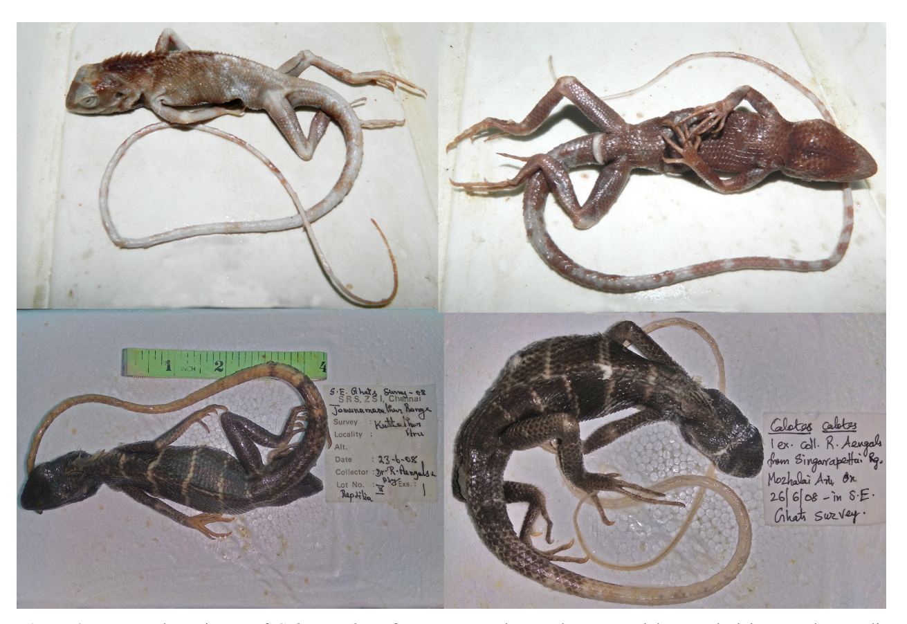
Figure 2. Preserved specimens of Calotes calotes from Eastern Ghats and Coromandel Coastal Plains, Southern India