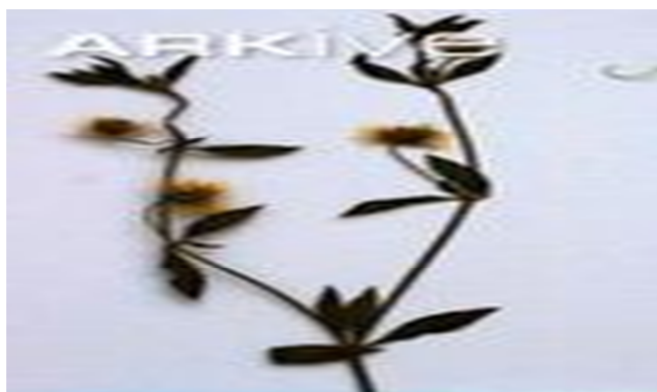
Figure No.2: Cometes Abyssinica