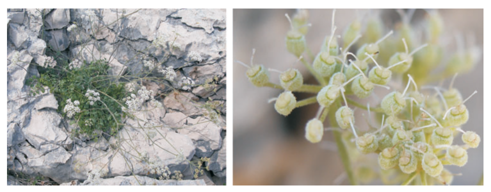
Fig. 1. Pimpinella tragium subsp. lithophila . a – habit on the island of Vis, b – tomentose ovaries (young fruits).