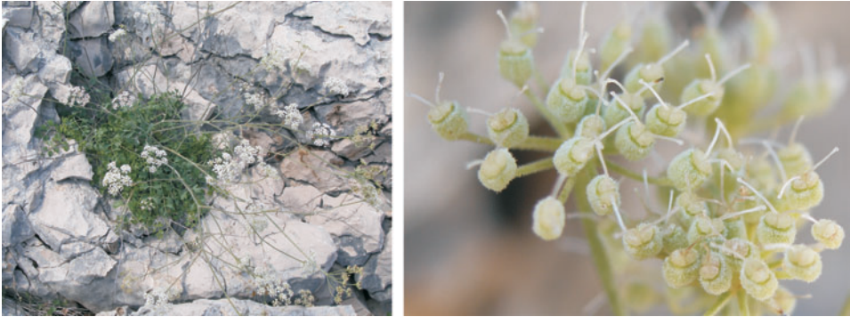
Fig. 1. Pimpinella tragium subsp. lithophila . a – habit on the island of Vis, b – tomentose ovaries (young fruits).

Distribution in Croatia: Central Adriatic, Dalmatia, Island of Vis (Fig. 2).