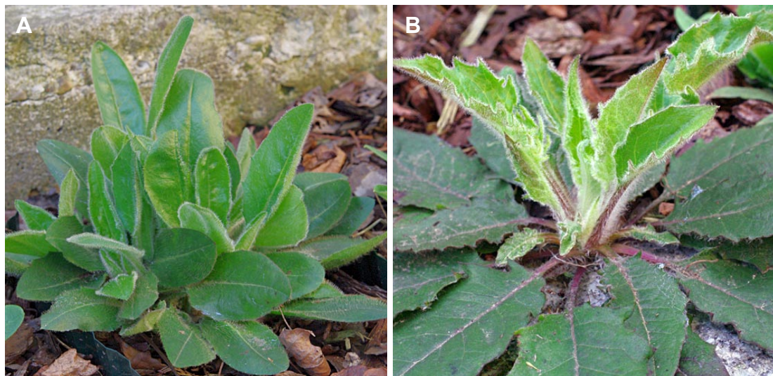
Fig. 3. Basal leaves of garden-cultivated plants: A – Hieracium tomosense Simk., B – H. praecurrens Vuk.

NOTE. The upper Tömösch River valley (Timiș in Romanian) in the Piatra Mare Mts is an area of a very rich flora, visited frequently by 19th-century botanists. On 12 August 1853, Ferdinand Schur collected there (‘Auf Nagelflur im Walde am Tömösch auf lockerer Dammerde’) specimens, based on which he described H. pseudomurorum Schur ‘media inter H. murorum et lasiophyllum ’ (Schur 1859: 209). This taxon was not included into Enumeratio Plantarum Transsilvaniae (Schur 1866), however. Simonkai (1886: 374) mentioned H. pseudomurorum as a synonym of H. transilvanicum , while Zahn (1935: 425, 445) included H. pseudomurorum into H. murorum s.l. As I have not seen the original material of H. pseudomurorum collected by Schur, I cannot decide its taxonomical placement.