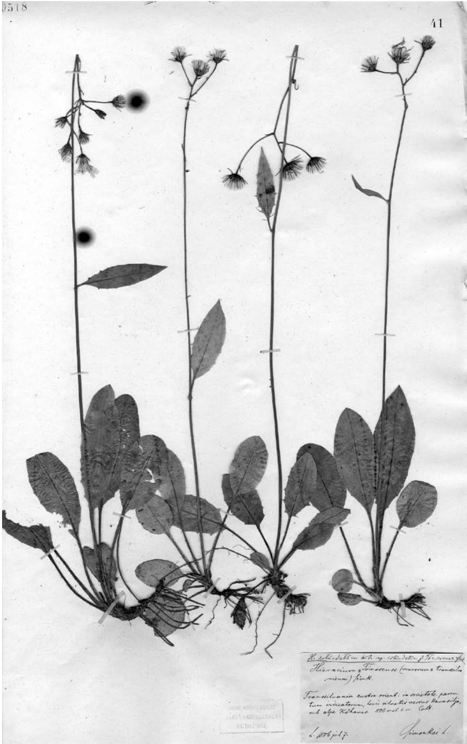
Fig. 1. Lectotype of Hieracium tomosense Simk.