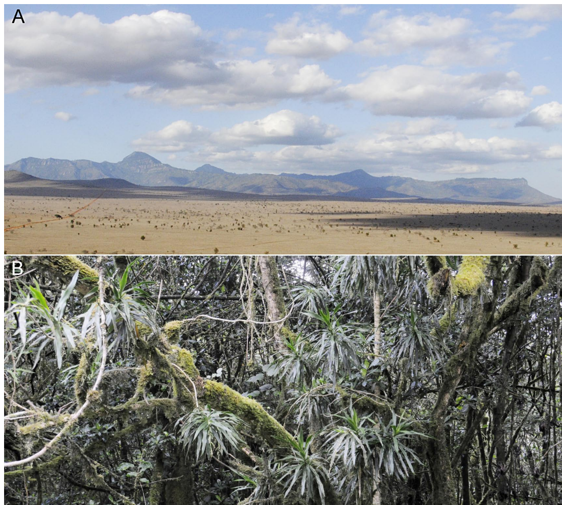
Fig. 3. Taita Hills. A – the mountains as seen from the southwest during the dry season in September 2012, B – moss-rich montane forest near the summit of Vuria, the highest peak of the Taita Hills.

nanii , Sorindeia madagascarensis , Teclea trichocarpa , Xymalos monospora , and Ficus sp. UTM 462044, 9576252. 1150 m. 16 Jan. 2010. Rikkinen 10K433 .