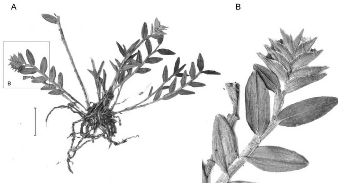
Fig. 2. Epilyna trilobata Kolan. & Szlach., sp. nov. A – habit, B – inflorescence closeup (isotype; PMA). Scale bar = 2 cm.

in apical part; lateral lobes oblong-ovate; apical lobule transversely elliptic, apiculate; apical margins of lobes minutely denticulate; disc in basal part with two subglobose, separated calli. Gynostemium 1.5–2.3 mm long.