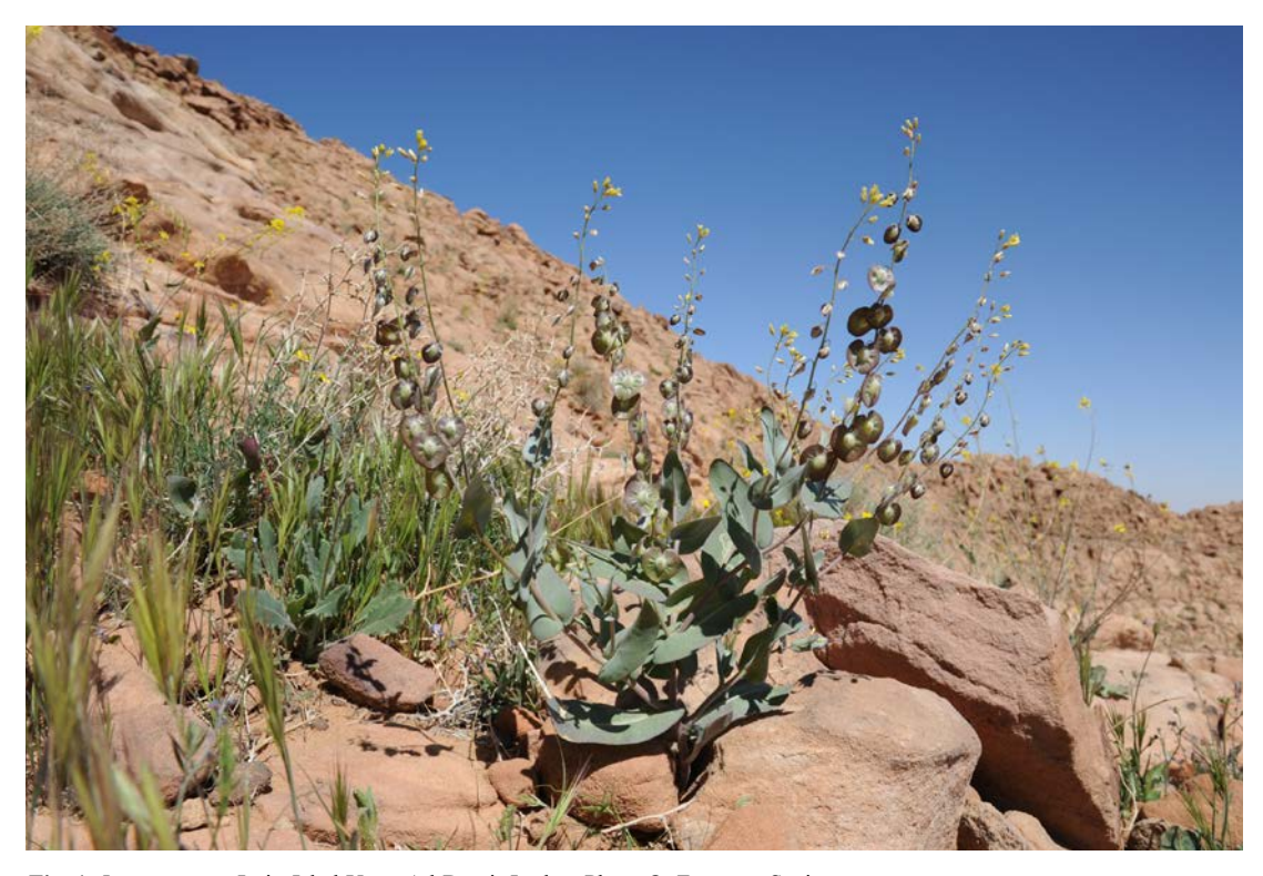
Fig. 1. Isatis armena L. in Jabal Umm Ad-Dami, Jordan.

flowers have erect pedicels, becoming recurved at fruit set. The petals are pale yellow. The fruit is an indehiscent winged discoid silicle 1.2 cm in diameter, cordate at the base. The silicle surface is tomentose, except for the wing. The 4–5 mm wide, dark-veined wing encircles the locule. A stylar tip persists at the distal end of the silicle. Isatis armena is distinguished from the sympatric I. lusitanica and I. microcarpa by the orbicular silicle and its cordate base.