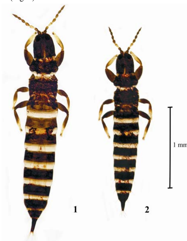
Figs 1-2. Hoplandrothrips famelicus (PRIES.): 1 – female, 2 – male.

brown, only the third is yellow and weakly asymmetric (Fig. 3). Antennal segment III with two sensoria, IV with four sensoria. Head longer than wide with small eyes about \frac{1}{4} of head length (Figs 1, 2, 9). Maxillary stylets narrow and long; maxillary bridge missing. Postocular setae expanded at apex about 50 \mu\text{m} long. Pronotal setae expanded at apex: aa – 37.5-42.5 \mu\text{m} , am – 6-7.5 \mu\text{m} , epim – 35-40 \mu\text{m} , pa – 35-37.5 \mu\text{m} , pm – 37.5 \mu\text{m} (Fig. 4). Mouthcone extends to half of prosternum (Fig. 5). Pelta D-shaped (Fig. 7). Pseudovirga spoon-shaped (Fig. 8). Abdominal setae rather short – those on segments IX and X shorter than length of tubus (Fig. 6).