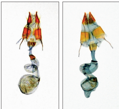
Fig. 3 – Female genitalia of Eublemma porphyria , Dobrogea (left), and Eublemma ostrina , Morocco (right) (Prep. gen. 4370 and 4371 / P. Gyulai)

Remarks: It was reported from Dobrogea for the first time from Măcin Mountains area, from Horia (Rákosy & Wieser, 2000). Subsequently it was found in Esechioi Forest (Dincă, 2005a), and in Babadag Forest (Székely, 2012a), suggesting that the species may be more widespread in Dobrogea than it is currently known. The northern limit of its range seems to be the Danube (it is absent from Ukraine).