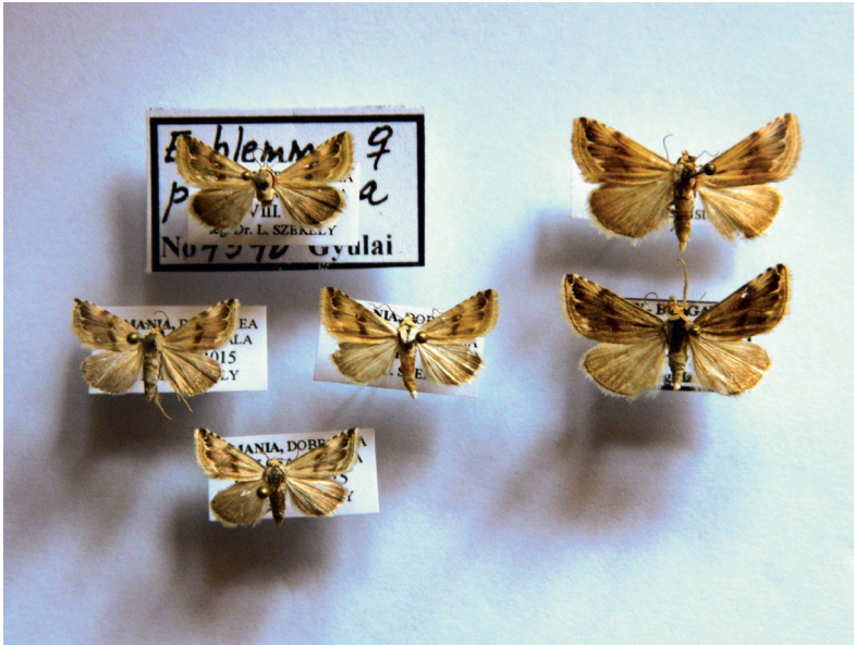
Fig. 4 – Eublemma porphyrina, Dobrogea (left), Eublemma ostrina, Bulgaria (right)

Other new records for the fauna of Dobrogea are: Hyloicus pinastris (Linnaeus, 1758) – Tulcea town; Cyclophora quercimontaria (Bastelberger, 1897) – Şipotele; Perconia strigillaria (Hübner, 1787) – Fântânița – Murfatlar; Cerastis leucographa ([Denis & Schiffermüller], 1775) – Babadag Forest.