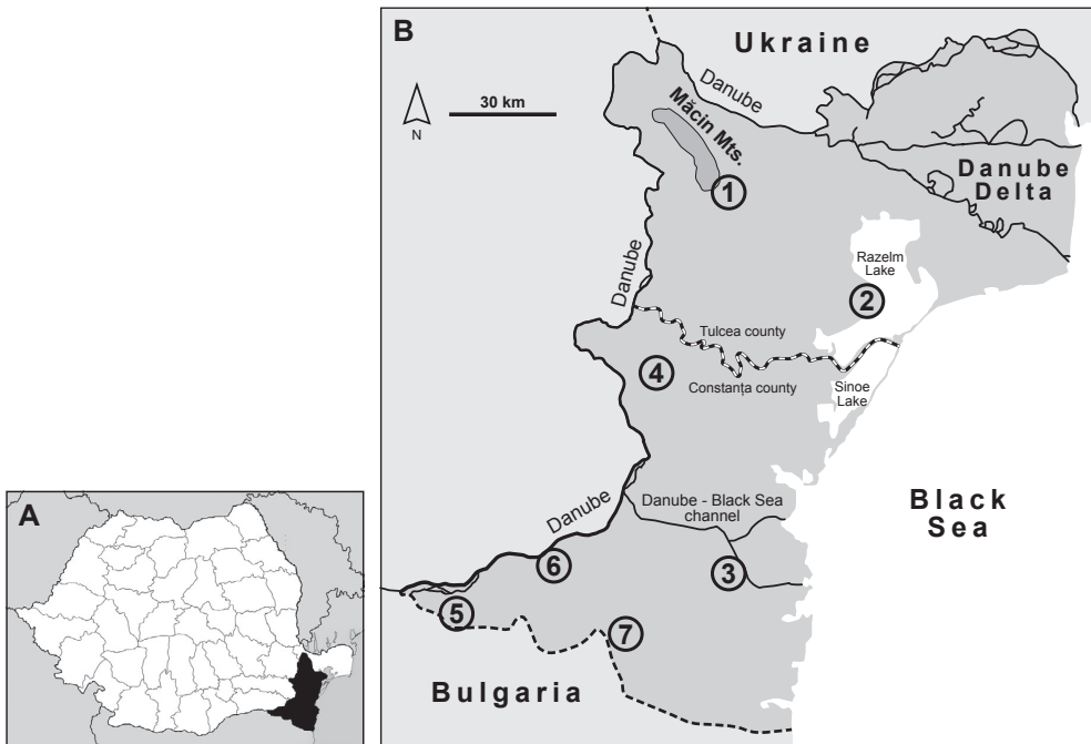
Fig. 1 – A, Location of the studied area in the Romanian territory; B, Map of localities investigated for this study in the period 2012–2015: 1 – Creasta Cardonului, 2 – Enisala, 3 – Fântânița–Murfatlar, 4 – Allah Bair Hill, 5 – Esechioi Forest – Bugeac Lake, 6 – Oltina, 7 – Şipotele.

Recent results concerning the fauna of Dobrogea are presented, with large amounts of data coming from new sites where Lepidoptera research had hardly been done before, for instance: Cardon-Hamcearca Ridge from Măcin Mountains, Enisala (also an archeological site), Allah Bair Hill, Canaraua Şipote. Only few data were published from Oltina and from Esechioi Forest – Bugeac Lake in the past (Popescu-Gorj, 1959; Popescu-Gorj & Drăghia, 1967; Rákosy & Székely, 1996). The records cover almost the whole period of the year in which Lepidoptera can be observed (April – November), except March, a month during which field work could not be performed in Dobrogea due to hard weather conditions. It is possible that, in March, two or three more Lepidoptera species little known or unknown in Romania are to be found in Dobrogea. The research periods were: Creasta Cardonului-Hamcearca (2014–2015), Enisala (2012–2015), Fântânița – Murfatlar (2013–2015), Allah Bair Hill (2012–2015), Esechioi Forest (2008–2015), Oltina (2014–2015), Şipotele (2014–2015). Sporadic data from Tulcea (the town area), Babadag Forest, Slava Rusă, Horia (Tulcea County), Limanu – Hagieni Monastery (near Mangalia), Palazu Mic, Sinoe, Gura Dobrogei, Dobromir (Constanța County) are included in this work. The material was collected using 125 W mercury vapour bulbs placed in front of a white sheet, powered