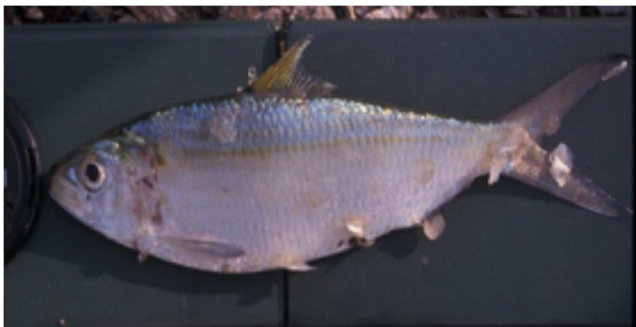
Figure 1. Ethmalosa fimbriata .

E. fimbriata is a popular fish consumed in Nigeria both as a source of protein and for taste. It is commonly known as bonga fish in the southern part of Nigeria. Jay [9] reported that most people in Nigeria prefer to use it fresh, but this desire has poorly been achieved due to its poor shelf life. This research therefore aimed at improving post-harvest loss of E. fimbriata by the use of improved processing techniques.