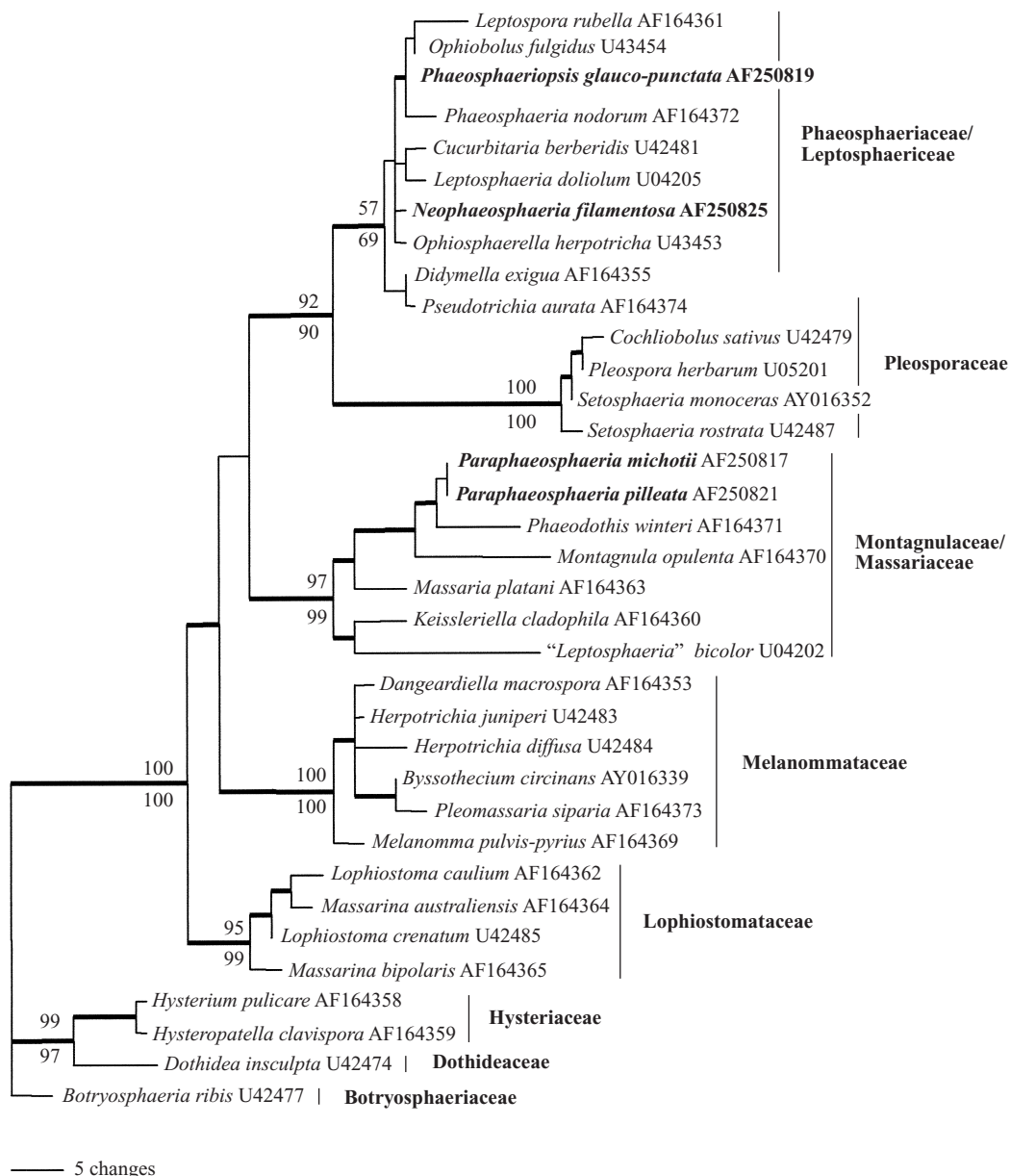
Fig. 1. One of 119 equally parsimonious trees resulting from analysis of 1069 bp of the 5' small subunit nuclear rDNA of some loculoascomycetous fungi, including taxa previously placed in Paraphaeosphaeria . Phaeosphaeriopsis glauco-punctata and Neophaeosphaeria filamentosa are the type species of the newly described genera. Length = 230, CI = 0.704, RI = 0.874, RC = 0.616 and HI = 0.297. Numbers above and below branches indicate parsimony and neighbour-joining bootstrap supports, respectively, expressed as a percentage. Bootstrap percentages are included for family-level groups only. Thickened lines indicate branch was present in the strict consensus tree.

although minor differences in terminal branching of taxa were observed.