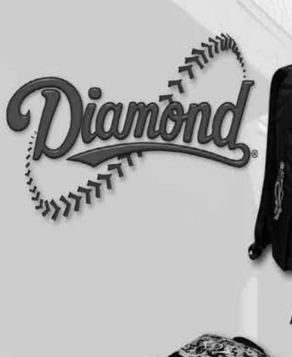
TravPack™ Available in Black