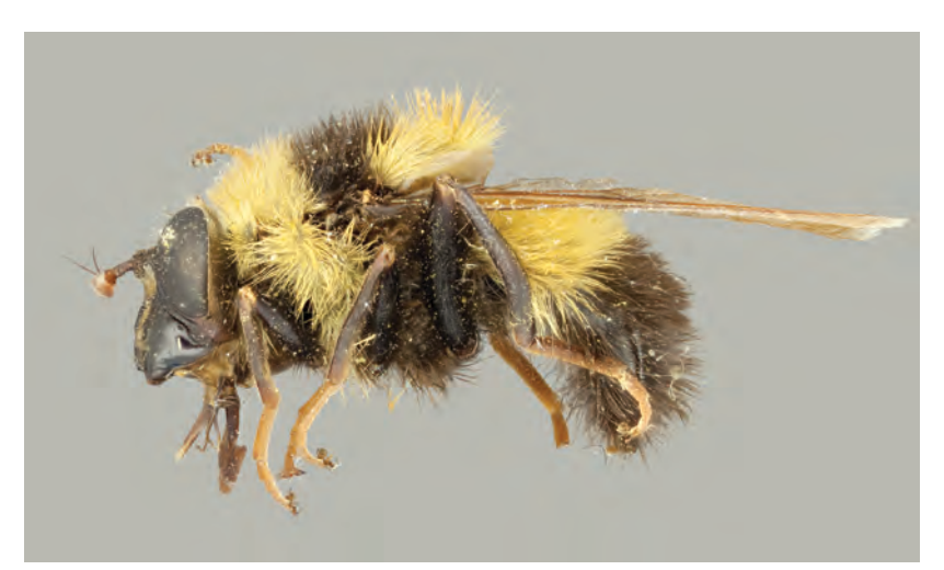
Examination of the holotype of Criorhina mystaceae showed that it fell within the range of typical variation of C. nigriventris. Having a good insect collection with series of specimens of each species allows us to examine variation within a species and refine our species hypotheses.