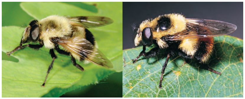
Both photos are of Volucella facialis . As with their model bumblebees, they have both orange and yellow marked color morphs.

their antennae (holoptic), whereas most females have smaller, completely separated eyes (dichoptic). Males also typically have one extra visible abdominal segment and often appear to have a swollen tip to their abdomen because of their genital capsule. Some syrphid species are sexually dimorphic, with males and females looking quite different. This gives us a bit more to learn and also means that the dimorphic species pages will be more crowded with illustrations of the characters of both sexes (see the sickleleg [ Polydontomyia ] page 84 for an example of this).