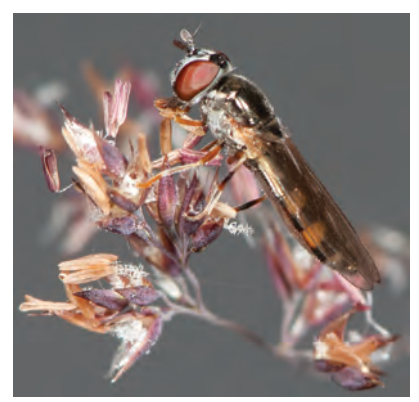
Unlike most syrphids, Platycheirus species can often be found in cloudy or even rainy weather.

When to Find Flower Flies Flower flies are most common in the shoulder seasons (spring and fall), but species vary markedly in time of emergence from the southern to northern ends of their range. Small regional field guides often show flight periods for each species, but given the broad latitudinal range covered by this guide, this is not attempted here and we provide only general estimates of flight