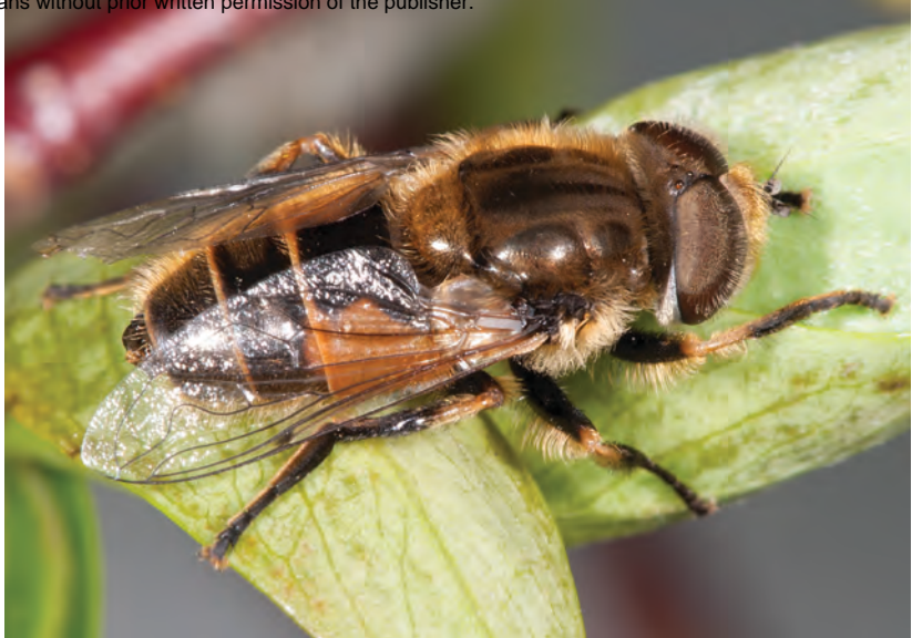
Eristalis brousii is one of our most rapidly declining syrphids. It has disappeared throughout most of its range and is now found in only a few places, one of which is Churchill, Manitoba.

after they are warmed up. Placing puparia in containers with moist peat moss usually works for rearing. Ensure that you include toothpicks or sticks that emergent flies can crawl onto to pump up their wings. Without this, the wings often fail to develop properly.