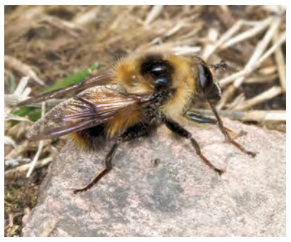
Criorhina nigriventris , a perfect mimic of an eastern Bombus (bumblebee).

black and yellow stripes/spots) and are thought to gain protection by looking more or less like bees and wasps and being small enough not to merit a second look by vertebrate predators.