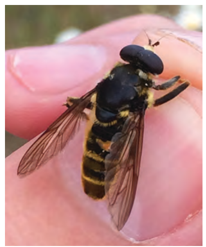
Syrphids can be handled for examination and later release by gently holding their legs between your fingers.

Carrying an insect net may not be for everyone, but if you want to identify all