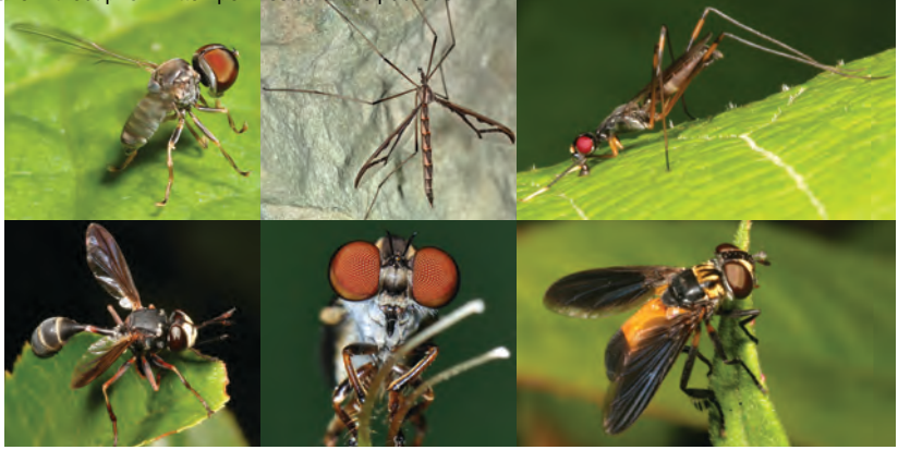
Almost all adult flies have two wings (most insects have four).