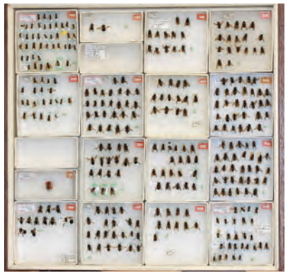
A drawer of syrphid specimens ( Blera ) from the CNC, showing regional colored labels

For general queries, contact webmaster@press.princeton.edu