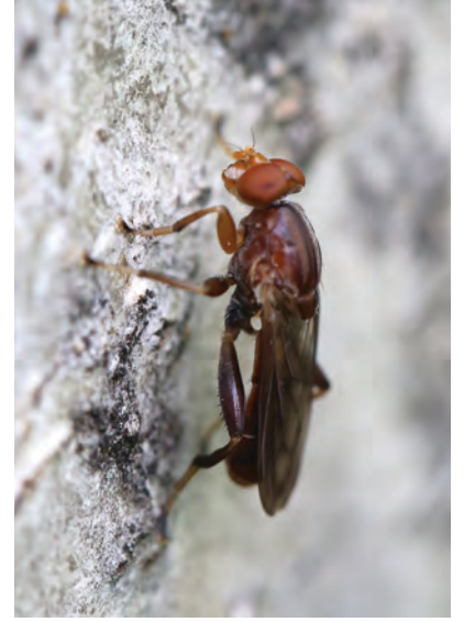
This is an undescribed species of Hammerschmidtia. Some undescribed species like this have been known for years, while others were discovered while producing this guide.

Common Names for Species Very few syrphids have been given common names, and many websites are now starting to offer common names for species with no attempt to standardize. We have proposed a set of common names for all Nearctic syrphids (http://www.canacoll.org/Diptera/Staff/ Skevington/Syrphidae/Syrphidae Nearctic_Checklist.htm) and provide them here with the species accounts. Our goal was to provide a single name for each group of species with descriptors added to each. This gives an idea of how species are related, much as generic names do. We tried to create these names with the global fauna in mind and thus hope that syrphidologists in other regions will follow our lead.