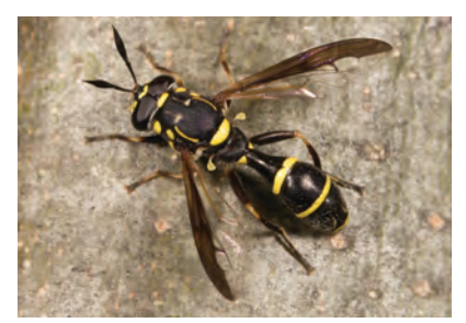
Ceriana willistoni is a rare syrphid that can often be found on hilltops. Mount Rigaud, Quebec, 24 May 2015.

One of the best ways to find the rarest syrphids is to go to hilltops. Males of rare or unpredictably distributed species cannot easily find a mate and use hilltops as landmark mating sites. Hilltops do not have to be high; they just need to be prominent to attract a hilltopping fauna. In flat areas, a low rise can function as a hilltop, whereas in rolling areas you should look for the most prominent hilltop to start your search. Ridges or escarpments tend to spread out the hilltoppers, so in these situations look for spots that are slightly higher or jut out. Hilltopping is very much a morning