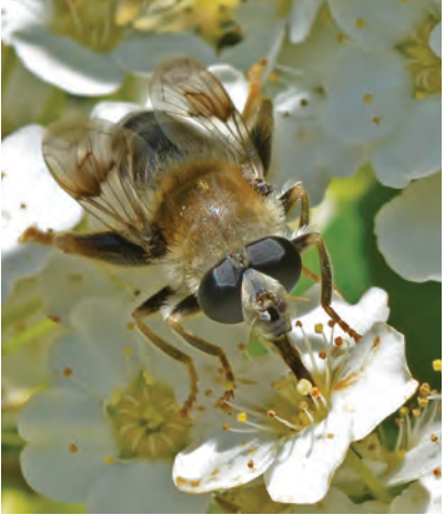
New research undertaken during the production of this field guide has shown that many preexisting species concepts cannot be supported. For example, molecular data and morphology refute the idea that Mallota albipilis is a single widespread species; instead it is four allopatric species. The midwestern species, Mallota illinoensis , is shown here. True M. albipilis is restricted to Arizona and New Mexico.