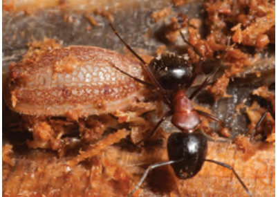
All of our Microdon larvae with known biologies are predators in ant nests. At least some mimic the pheromones of their host ants to avoid detection.

Syrphids are also a model system for research into mimicry. Most adult syrphids mimic wasps or bees in some way. There are some spectacular cases of "perfect mimicry" where syrphids look and behave almost exactly the same as their models. Have a look through the wasp flies (Ceriana), swiftwings (Volucella), yellowjacket flies (Sphecomyia), and mimics (Mallota) to get an appreciation for these remarkable feats of evolution. If you think that the physical resemblance is impressive, wait until you see some syrphids in the field. Some falsehorns (Temnostoma), pond flies (Sericomyia), and hornet flies (Spilomyia) waggle their prolegs to mimic wasp antennae. Their legs are patterned just like their wasp models'. Catch a swiftwing in your hand and you will likely release it on impulse when it buzzes just like a bumblebee. These mimics obtain considerable protection by looking and behaving like stinging wasps and bees. No syrphids bite or sting, but they certainly advertise that they do. While the larger syrphids are often perfect mimics, most of the smaller species (most of the Syrphinae, for example) are known to be "imperfect" mimics. These species have converged on general wasp models (i.e.,