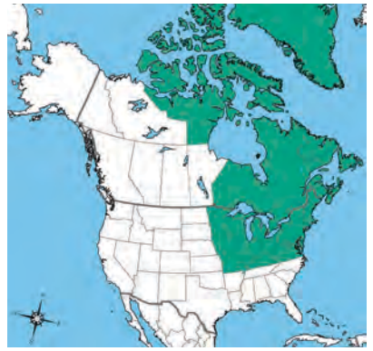
All syrphid species known from the greenshaded area are included in the guide.