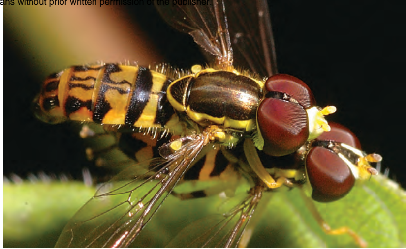
Most males can be distinguished from females by looking at the eyes. In these mating Toxomerus , the male's eyes (top) touch in front but the female's (bottom) do not.