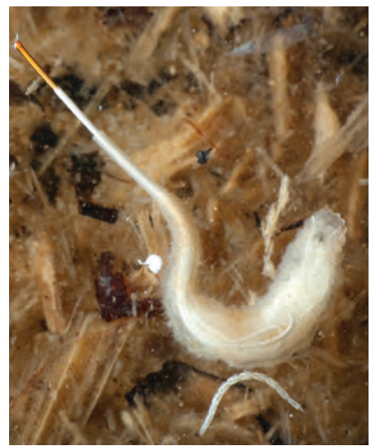
Many rat-tailed maggot larvae ( Eristalis and relatives) are important recyclers in ponds and lagoons, while others live in tree holes, bromeliads, and other standing water. This one was in a tree hole in Backus Woods, Ontario.