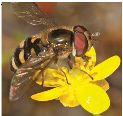
Imperfect mimics like this Eupeodes all converge on a similar gestalt, making them very difficult to identify.

Field photos were used when available and when we were able to definitively identify species in the photos. Specimen vouchers support many of these field photos and are available in the CNC and DEBU. Museum photos are linked to specimens in the AMNH, CNC, DEBU, and USNM. If there are ever questions about the identity of specimens, we can trace the photos back to these specimen vouchers to check. Lab photos were mostly taken with a Canon EOS 50D