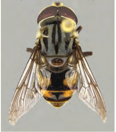
New species are sometimes genuine new discoveries made in the field, but more often they are sitting under our noses and have previously been overlooked in collections. This new species of Palpada was discovered when we noticed that DNA from Nearctic Palpada furcata was different from DNA of tropical P. furcata specimens. Morphological examination supported the fact that these were two species rather than one.