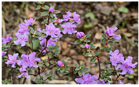
R. nitudulum var. nitudulum

Our next drive gave another taste of the richness of Lapponicas in Sichuan. On the way from Tagong to Kangding, there were extensive stands of R. websteranum along the road sides. When we were emerging from Zheduoshan Pass near the Kangding area airport at 4298 m. (14,101 ft.) more Lapponica species turned up and most of them in full flower. R. intricatum was stunning, with its Daphne -like flowers in a fine palette of blues, also R. nitidulum and R. nivale . At the highest point, 4214 m. (13,825 ft.) some special forms occurred. First found was one single plant of R. nivale with flowers in a deep pink, almost soft purple, and then R. intricatum with pink flowers. Since the area was large and impossible to search through in half an hour, I feel sure more interesting flower varieties would be found given enough time. On the other side of the pass, nearer to Kangding, we passed a hillside with lots of R. concinnum var. pseudoyanthinum (Chamberlain 1996),