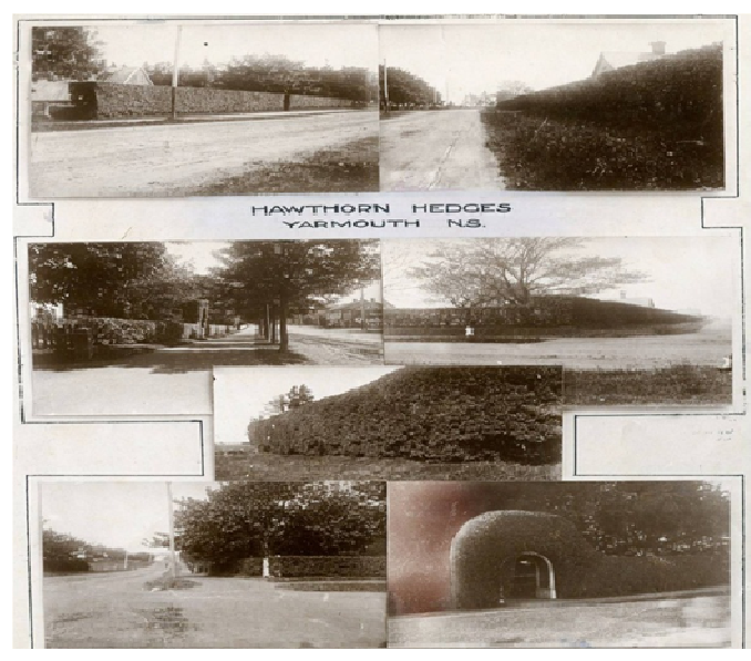
Hawthorn hedges of Yarmouth c. 1899.

English Hawthorn<sup>1</sup> ( Crataegus monogyna ) was the preferred choice as a hedge shrub during the Victorian era in Yarmouth, Nova Scotia. It is hardy, easily trimmed to produce thick foliage, and it can be coaxed and pruned into various shapes and heights. It also has nasty thorns that keep man and beast from passing through it. In addition, hawthorn can be cut to the ground when it becomes too coarse, and new growth will spring from the roots to regenerate the hedge. Other trees and shrubs such as fir, white spruce, and European beech were sometimes used for hedges, but English hawthorn seems to have been the most common choice.