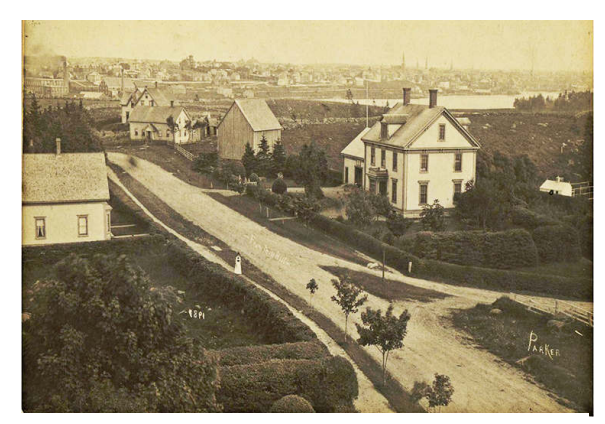
Hugh Cann house in 1891, showing extensive hawthorn hedges.