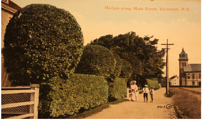
Postcard c. 1906, showing hawthorn hedges along Main Street, Yarmouth

<sup>1</sup>The Pilgrim ship, Mayflower , is said to have been named for the "Mayflower tree", a common name for the hawthorn in 17<sup>th</sup> century England. A.E Roland, revised by M. Zink, The Flora of Nova Scotia , Halifax: Nimbus Publishing and the Nova Scotia Museum, 1988. ¤