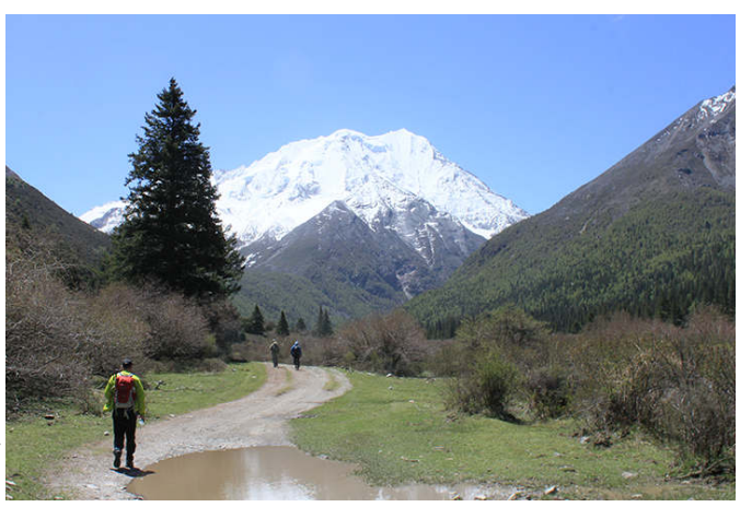
On the road to Heize Shan

Instead, we now had the beautiful mountain called Heize Shan in front of us, and so we followed a dusty road towards it. Here we had our first meeting with R. websteranum . This species was not introduced until 1990, and is quite rare in cultivation. Its upright growth habit and greyish-green leaves are good identifying features. It seems odd that this species was introduced so late as we saw literally thousands of plants along the roads, especially in yak-grazed landscapes where little else grew. The yaks obviously do not like eating rhododendrons!