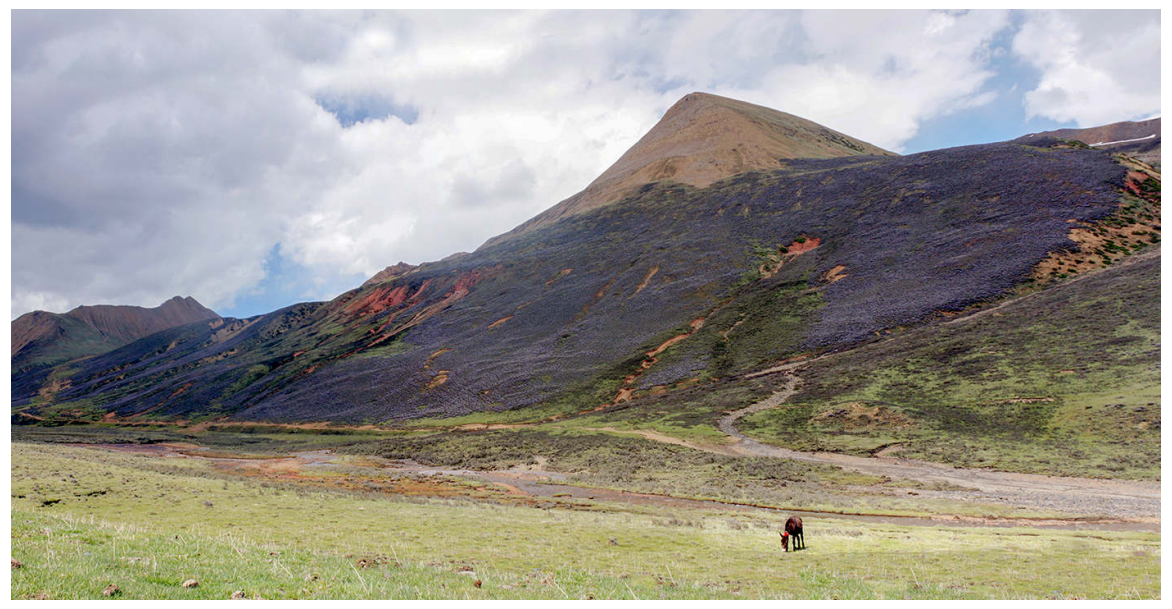
The climax of a Lapponica Odyssey: the simultaneous flowering of R. intricatum , R. nivale and R. nitidulum on the hillsides of the upper Yulongxi valley.

The Gongga Monastery had a few rooms for tourists and we stayed there on our last night of the trek. On the way back, we spent one more night in Kangding and then we were on the road, bound for Chengdu. We ended up on the 19<sup>th</sup> floor of a hotel in the very center of the town and had plenty of time for walks and shopping. I had planned to buy t-shirts for my grandchildren with Chinese text on them, but that turned out to be impossible. All available t-shirts with text were in English! Even shirts with "US army" were for sale! I wonder how Mao and Chou would have felt about that! Deng, on the other hand, would have perhaps approved, as long as they made money.