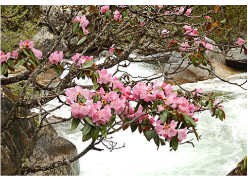
R. bureavoides by the stream below Mugecuo Lake National Park.

The next two days we spent around Ya Jia Gen Pass, with the highest point at 3850 m. (12,631 ft.). The best find here was three colonies of the rare Pogonanthum species R. rufescens , just below the top of the pass on both sides. According to the Flora of China (www.efloras.org/florataxon.aspx? flora_id=2&taxon_id=200016547), this species can be found in several parts of Sichuan, but very few western plants-people of today have seen it in the wild. R. rufescens was described as early as 1895, but is still not much known in European