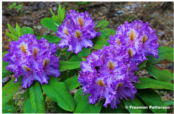
Two eye-catching Rhododendron hybrids from Freeman's collection. Many of these came from Jack Looye's Rhodoland Nursery.