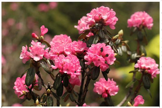
Very deep coloured R. primuliforum.

also referred to as simply R. concinnum and a little later, R. oreodoxa var. fargesii. Both species were flowering well. A stand of deep pink R. primuliflorum was also very impressive, the flower colour being almost as red as that of R. kongboense.