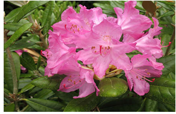
R. smirnowii.

I should point out that I did not use R. macrophyllum in my crosses, but I suspect that its hybrids would have been among the survivors, had I done so. What is interesting about the above list is where the parent species come from, and the climates in which they grow. Not one is from the monsoonal center of rhododendron diversity in Southeast Asia. They are all from peripheral regions with some degree of summer drought.