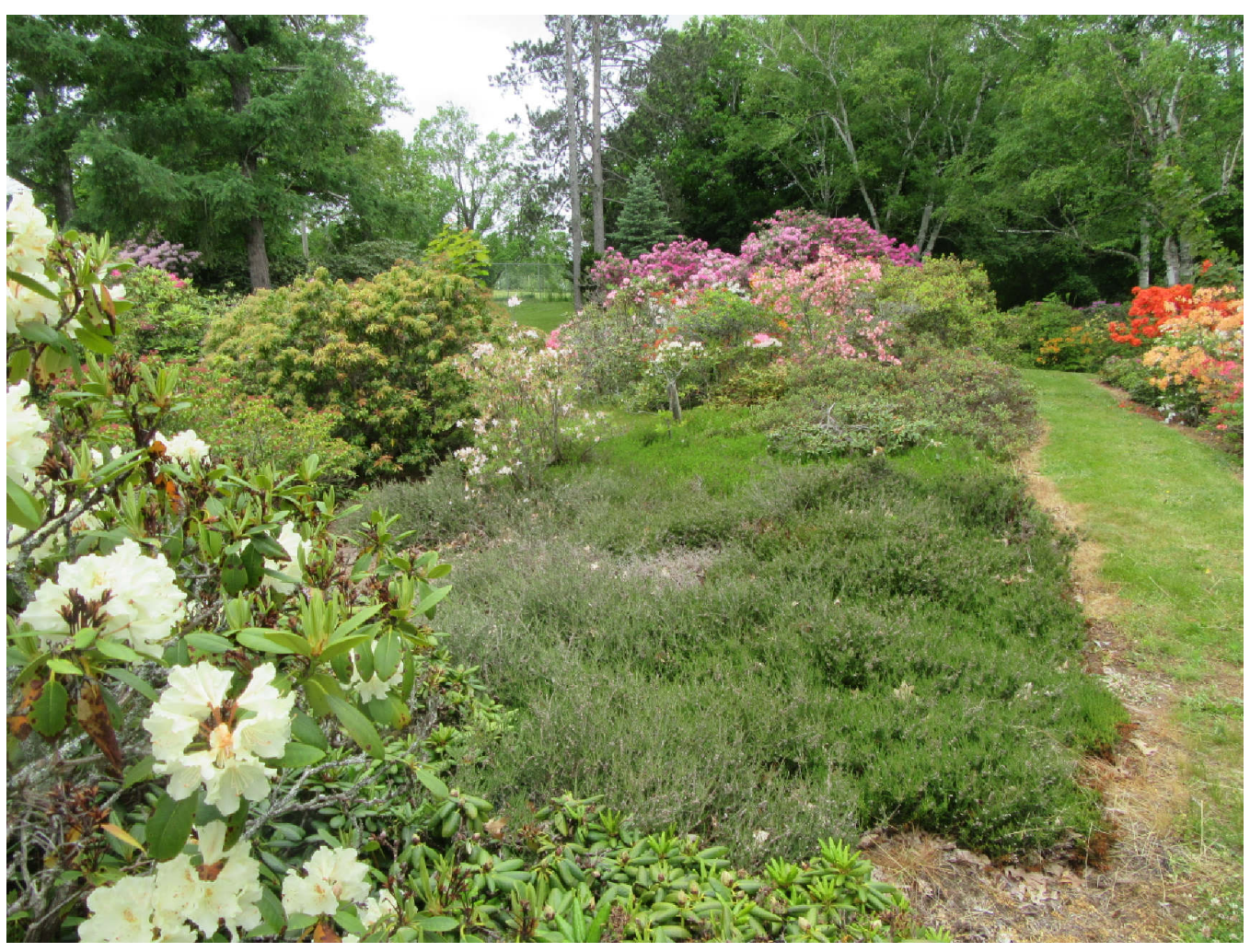
A garden bed highlighting rhododendrons at the Kentville Agricultural Research Station [Sheila Stevenson]