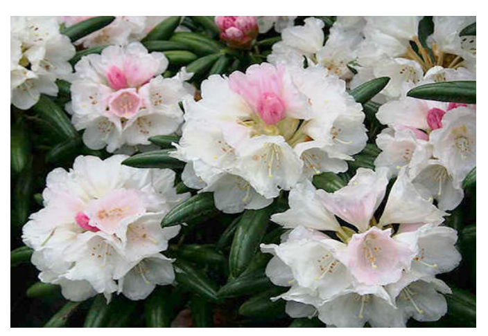
R. degronianum subsp. yakushimanum.

So, in summary, all the surviving hybrids in the field have parents with some degree of natural drought resistance. This seems to have combined in various ways to produce exceptionally drought- tolerant offspring. As I said earlier, it was not my intention to research drought tolerance, but the results are so striking that I thought it worth documenting. ¤