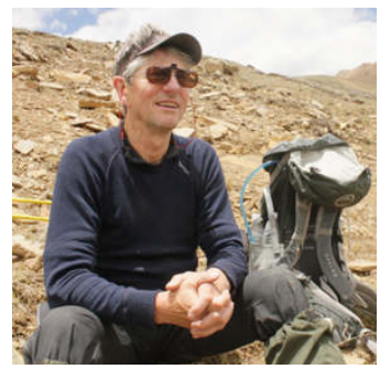
The author at Pan Pan Pass, 4700 m, the highest point in the trek.