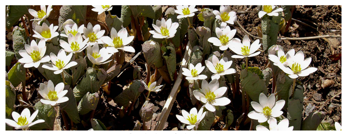
Sanguinaria canadensis (Bloodroot)

Children's art session in the garden. Activities to be announced. ¤