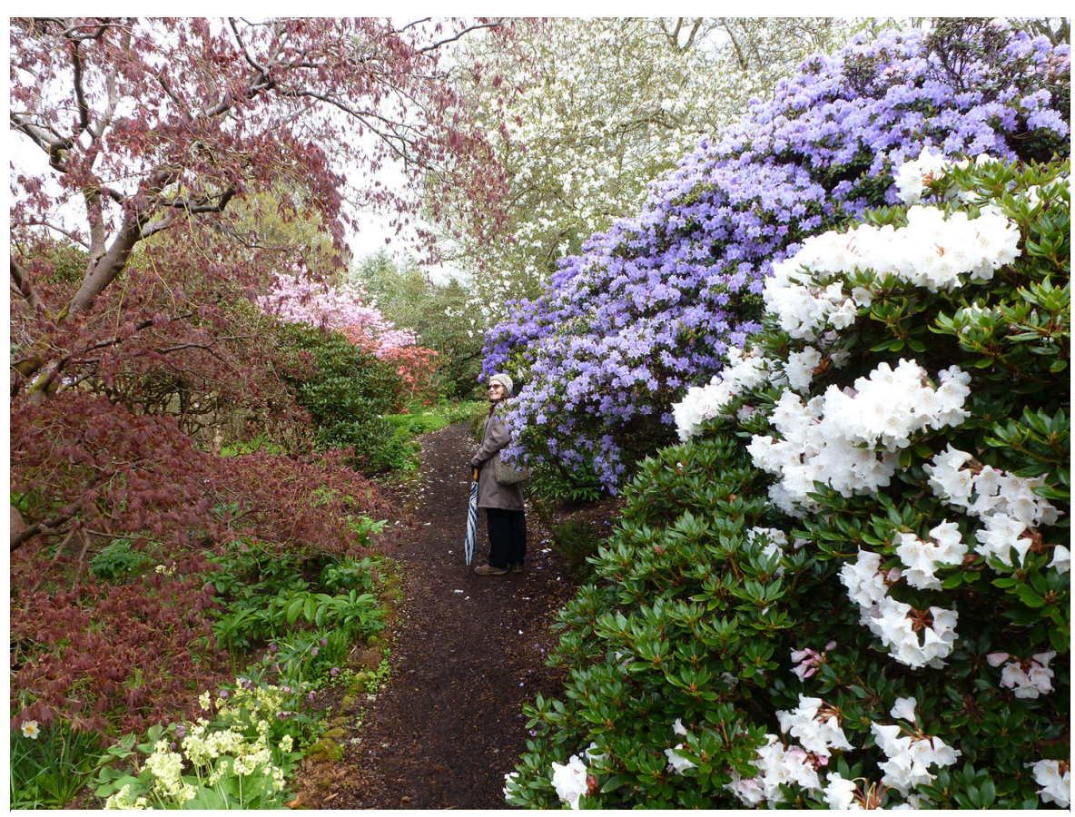
Spring display, Branklyn Garden, Perth Scotland