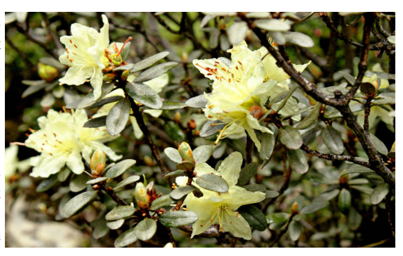
R. rupicola var. chryseum

We continued walking through more alpine landscape for some days, crossing Pan Pan Pass (4700 m. 15,420 ft.) and Longjiman Pass (4600 m. 15,092 ft.). From this last pass, we had a wonderful view to the peak of the majestic Gongga Shan. The weather was fine most of the time, and a t-shirt was enough at the Longjiman Pass, but the temperature dropped down to near freezing one clear starry night. The descent from Pan Pan Pass into the upper Yulongxi valley was what inspired the name for this article. As we walked down, more and more Lapponica species were in flower, and soon