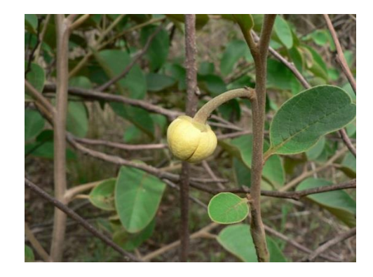
Anthocleista procera Lepr. ex Bureau