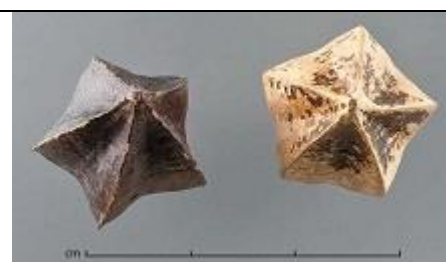
Quisqualis indica seeds