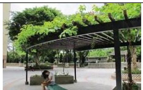
Planting on a shelter for shading in Mei Foo Sun Tsuen