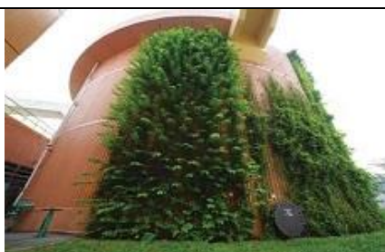
Vertical greening at Sha Tin Sewage Treatment Works