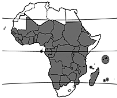
Map of the Africa geographical distribution.