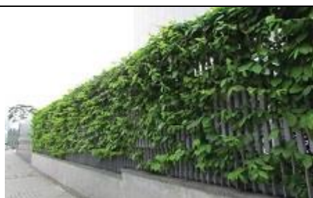
Vertical greening on fence wall at Chief Executive's Office