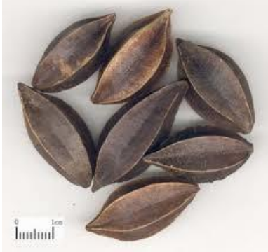
Quisqualis indica seeds