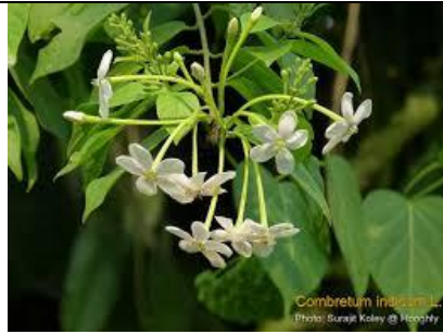
Combretum indicum