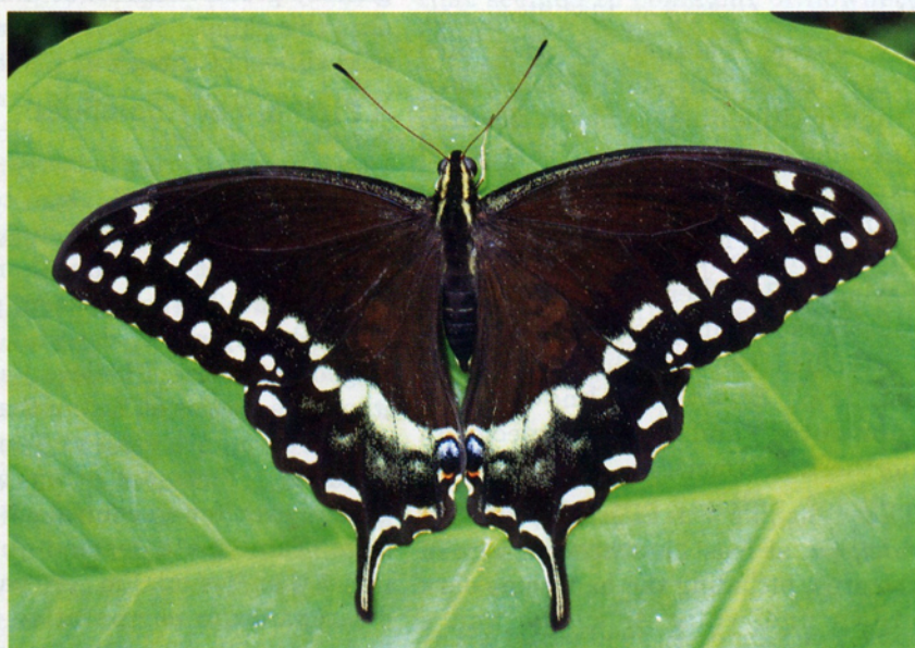
Left: Larva of Papilio palamedes leontis on Litsea pringlei. Above: Adult P. p. leontis at rest.