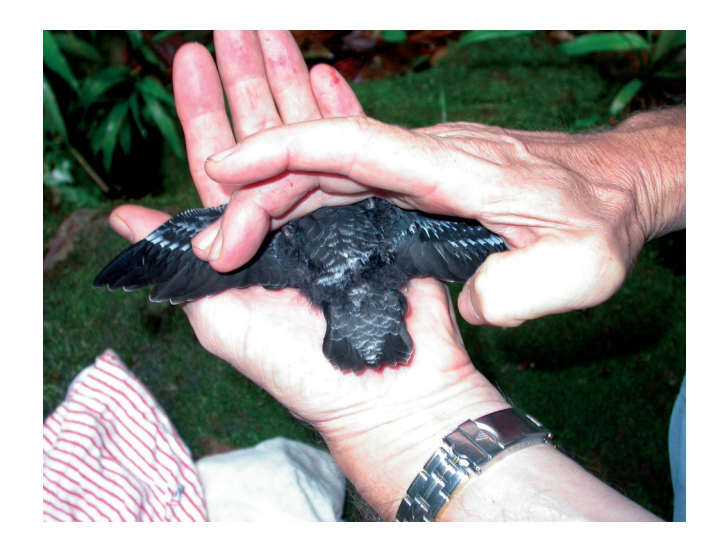
FIGURE 4: Diagnostic underpart pattern of Cypseloides cryptus nestling on 29 July 2007 Salto do Ype, Presidente Figueiredo, Amazonas Brazil.