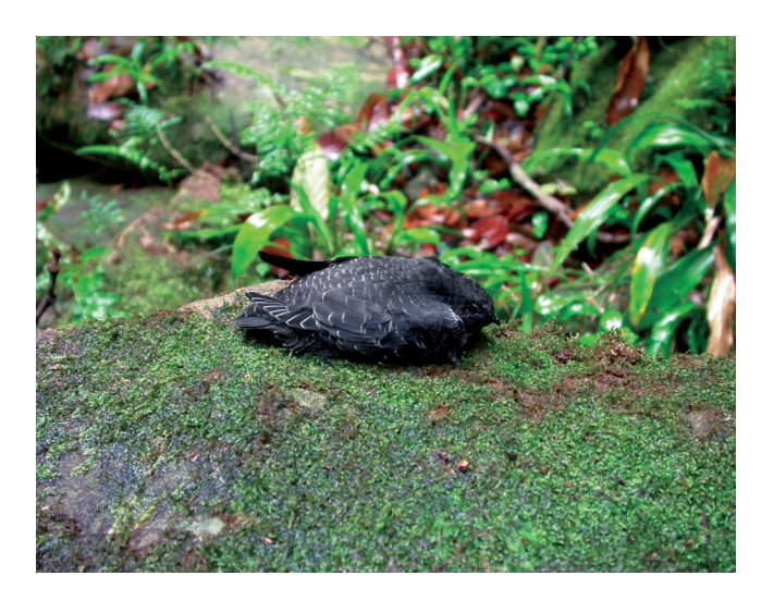
FIGURE 3: Cypseloides cryptus nestling on 29 July 2007 Salto do Ype, Presidente Figueiredo, Amazonas Brazil.