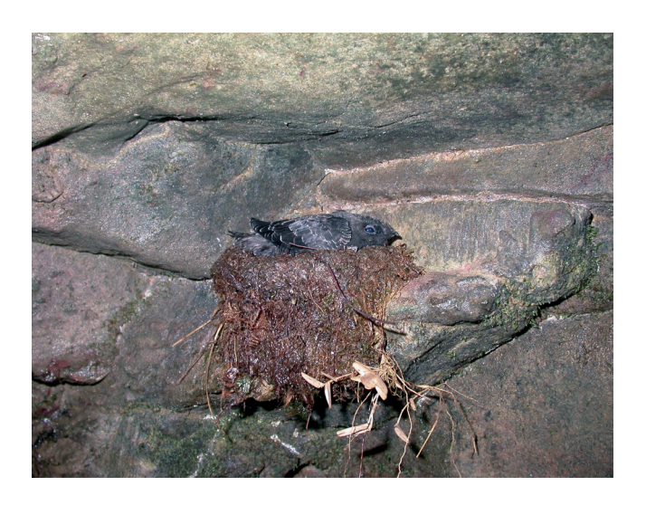
FIGURE 2: Nestling Cypseloides cryptus in nest on 29 July 2007 at Salto do Ype, Presidente Figueiredo, Amazonas Brazil.