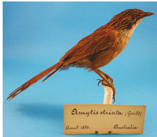
Figure 1. RMNH Aves 172018: female Amytornis modestus inexpectatus , from the collection of John Gould 1840–41, the plains bordering the lower Namoi, northern New South Wales (Justin J. F. J. Jansen)