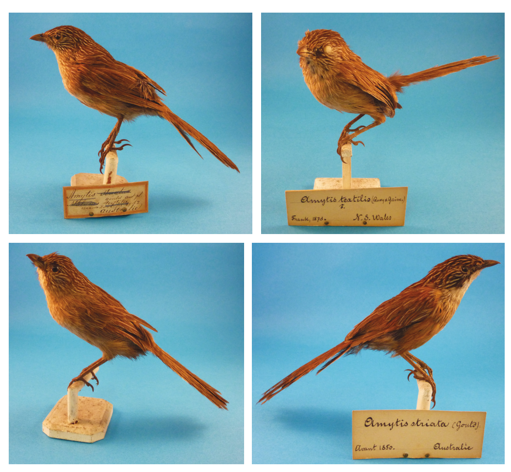
Figure 1. RMNH Aves 172018: female Amytornis modestus inexpectatus , from the collection of John Gould 1840–41, the plains bordering the lower Namoi, northern New South Wales (Justin J. F. J. Jansen)

Figure 2. RMNH Aves 172019: male Amytornis modestus inexpectatus , from Frank, dealers, 1873, New South Wales (Justin J. F. J. Jansen)