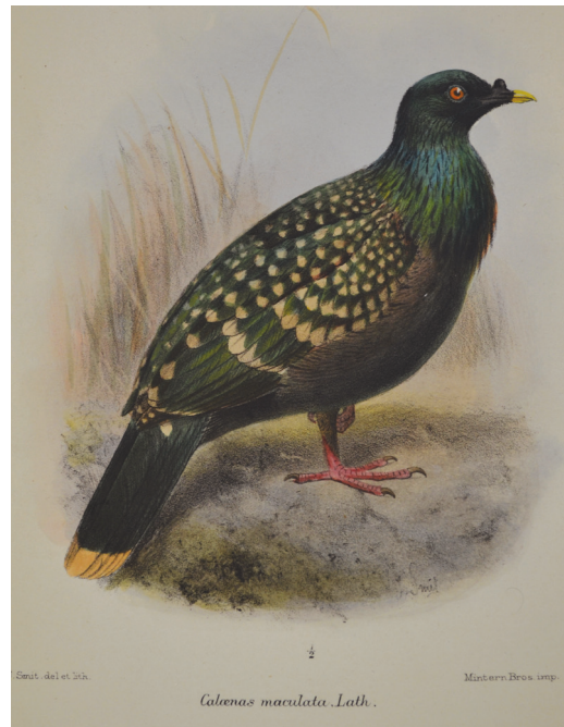
Figure 2. Depiction of Spotted Green Pigeon Caloenas maculata in Forbes (1898), made by Joseph Smit and based on how Forbes assumed the species looked like.