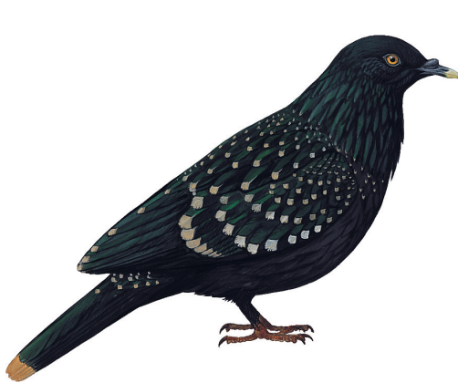
Figure 3. Depiction of Spotted Green Pigeon Caloenas maculata in Fuller (2002) by Brian Small and based on how Fuller assumed the species looked like