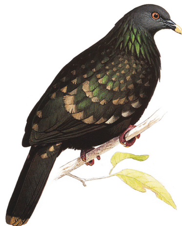
Figure 4. Depiction of Spotted Green Pigeon Caloenas maculata in Gibbs et al. (2001), made by John Cox and based on how Gibbs assumed the species looked like; perching on a branch is probably more accurate than walking on the ground