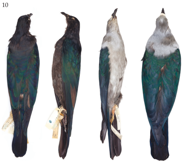
Figure 5. First museum label after the Spotted Green Pigeon Caloenas maculata specimen was re-prepared into a skin (Hein van Grouw)