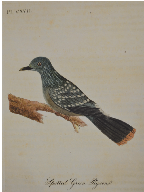
Figure 1. Drawing (engraving) by Latham of Spotted Green Pigeon Caloenas maculata in A general history of birds (1823), presumably based on a picture in Lever's possession; Lever's picture may have been based on a third specimen.