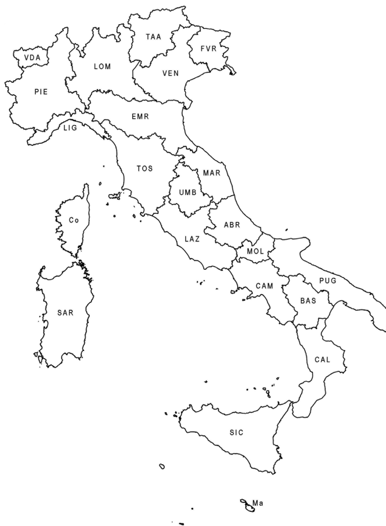
FIGURE 1. Map showing the twenty administrative Italian regions, Corsica, France (Co) and Malta (Ma). Valle d'Aosta, VDA; Piemonte, PIE; Lombardia, LOM; Trentino-Alto Adige, TAA; Veneto, VEN; Friuli-Venezia Giulia, FVG; Liguria, LIG; Emilia-Romagna, EMR; Tuscany, TOS; Marche, MAR; Umbria, UMB; Lazio, LAZ; Abruzzo, ABR; Molise, MOL; Puglia, PUG; Campania, CAM; Basilicata, BAS; Calabria, CAL; Sicily, SIC; Sardinia, SAR.