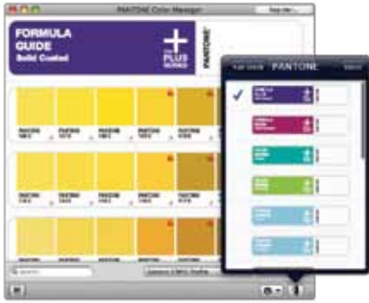
Available as a free download with PANTONE PLUS and FASHION + HOME color guides.

COLOR MANAGER Software is a robust desktop application that provides the assurance and confidence to use the latest PANTONE Colors accurately.