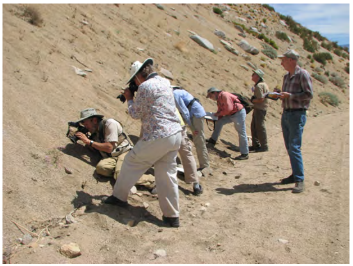
Oak Creek/Division Creek Field Trip

The second stop was along the mud flow of the North Fork of Oak Creek, where we had a view of the new channel of the South Fork caused by the flood. We saw two species of Ambrosia , one with a new genus name. We stopped a couple more times on our way to lunch at the Baxter Pass trailhead, where Lupinus excubitus and Malacothamnus fremontii were blooming vigorously and the re-sprouting oaks provided a bit of shade. Phacelia, chia, a bright pink gilia, and Camissonia were blooming on a sandy road-cut near the trailhead and everyone was eager to get a look and maybe a photo.