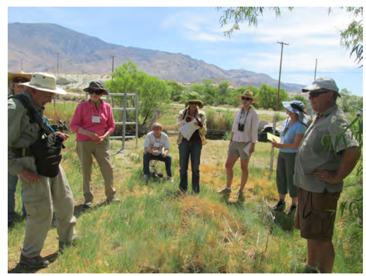
At the Owens River

After Independence we went south to Lone Pine. On Lone Pine Narrow Gage Road, we stopped along the Owens River where I covered some details of the Lower Owens River Project and the group explored some of the river flood plain. In the floodplain, we had Helitopium curvassavicum and Anemopsis california in bloom and Ericameria nauseusa var. orioplila, Atriplex torreyi, and willow species — S. goodingii, laevigata and exigua—in the salt grass Distichlis spicata meadow.