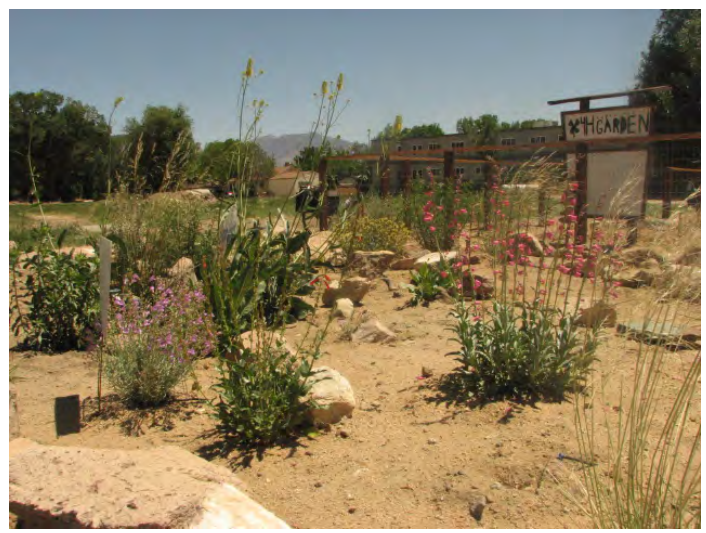
Bishop Community Garden

After the muted colors of winter, the gardening urge hits each spring. We want color and green plants again. However, for natives fall is the best time to plant. The days are cooler so their roots can get established without having to deal with the high temperatures.