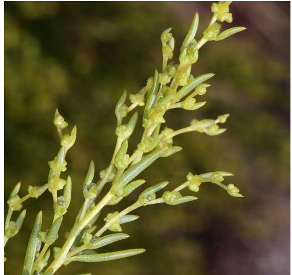
Suaeda occidentalis

two species). Of the Suaedas , we saw only S. occidentalis , which got me quite excited last year as there were no records of it in Inyo county, only one in Mono County, with six in the entire state (Consortium of California Herbaria; CCH). At a distance it resembles the more common Nitrophila occidentalis (which has opposite leaves) but alternate leaves were a clue that I had found something else.