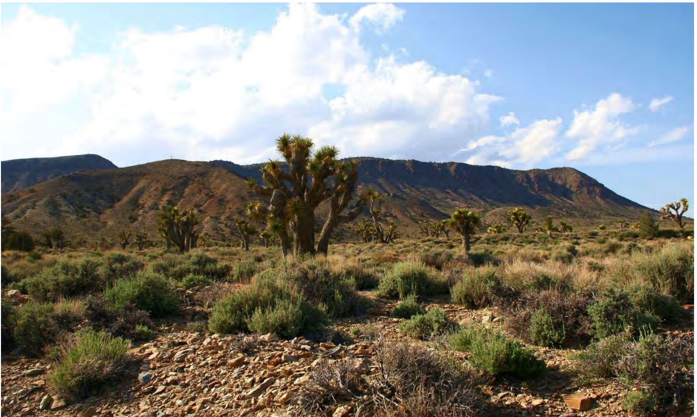
Joshua tree ( Yucca brevifolia) woodland at Conglomerate Mesa