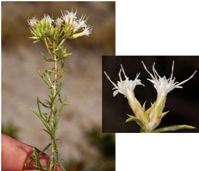
Ericameria albida

Last year I was impressed with all the interesting plants blooming in the alkali meadows next to Klondike Lake. Plants like white-flowered Rabbit brush ( Ericameria albida ) and Chloropyron maritimum are found in abundance here but not too many other places in the state or even the Owens Valley.