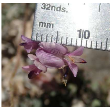
Top left: Inyo milkvetch (Astragalus inyoensis). Top right to lower right: Pinyon mariposa (Calochortus bruneaunis) and another Badger Flat threadplant (Nemacladus inyoensis) sighting on Conglomerate Mesa.

I am happy to report that I was able to make considerable progress on my floristic research in the southern Inyo Mountains despite several unforeseen disruptions. Like many others, I made the difficult decision to postpone my spring field research in accordance with California's "stay-at-home" order.