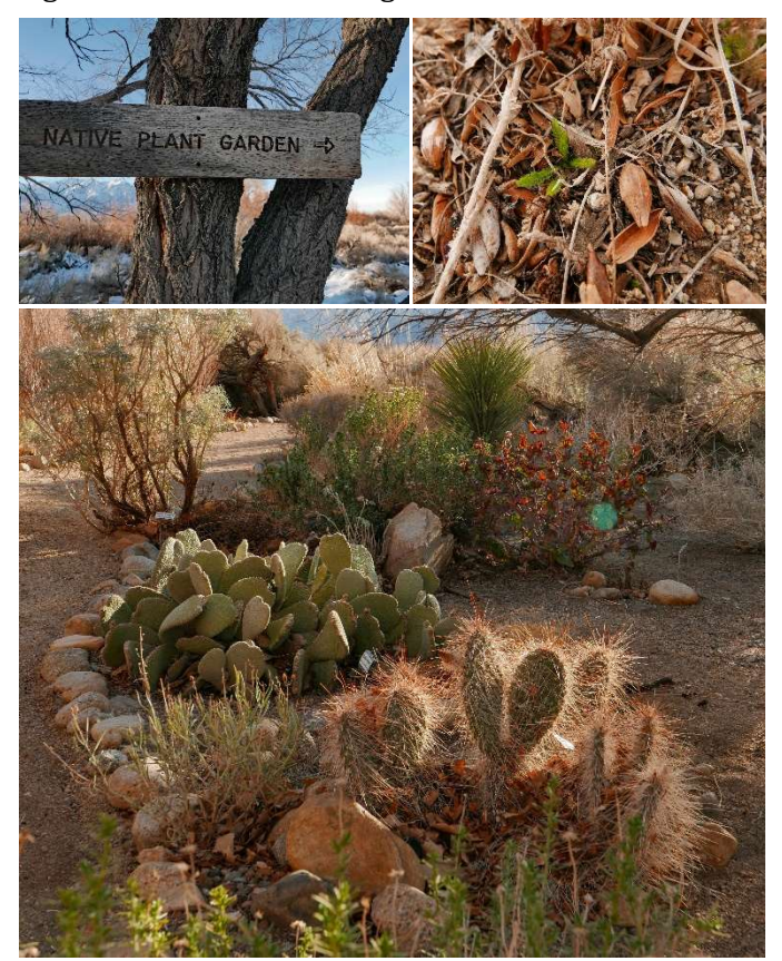
Top left to right and bottom, respectively: Sign at the entrance to the Mary DeDecker Native Plant Garden, tiny yarrow shoots peeking out through the litter, and an assortment of other natives found along the trails of the garden.

Spring is just around the corner, at least in the lower elevations of our chapter area. Today, working at the Mary DeDecker Native Plant Garden, I observed tiny fresh green leaves emerging from some of the plants. Desert and Palmer's penstemon, fernbush, California goldenrod and green rabbitbrush all exhibited the lushness of approaching spring. Diminutive shoots pushed up through the soil in the shelter of the largest bushes. Even the small amount of recent precipitation has been eagerly absorbed, plumping the cactus pads. The garden displays the telltale signs that winter is fleeting.