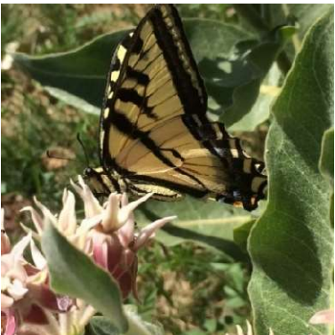
Western Tiger Swallowtail ( Papilio rutulus ) nectaring on showy milkweed ( Asclepias speciosa ).