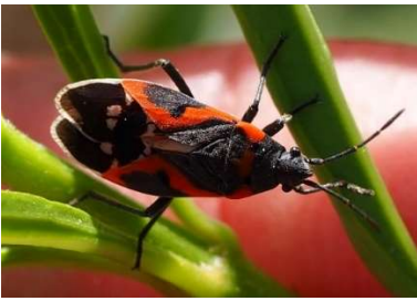
Small milkweed bug ( Lygaeus kalmii kalmia ) on narrow leaf milkweed ( Asclepias fascicularis ).