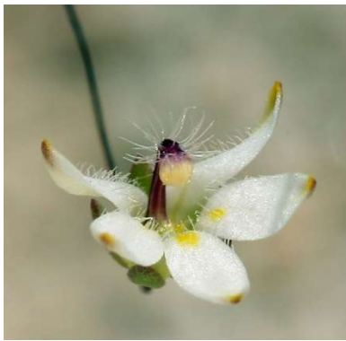
Clockwise from top left: Nemacladus morefieldii, N. inyoensis, and N. matsonii.