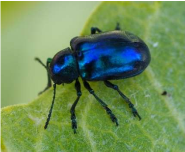
Cobalt milkweed beetle ( Chrysochus cobaltinus ) on showy milkweed ( Asclepias speciosa ).