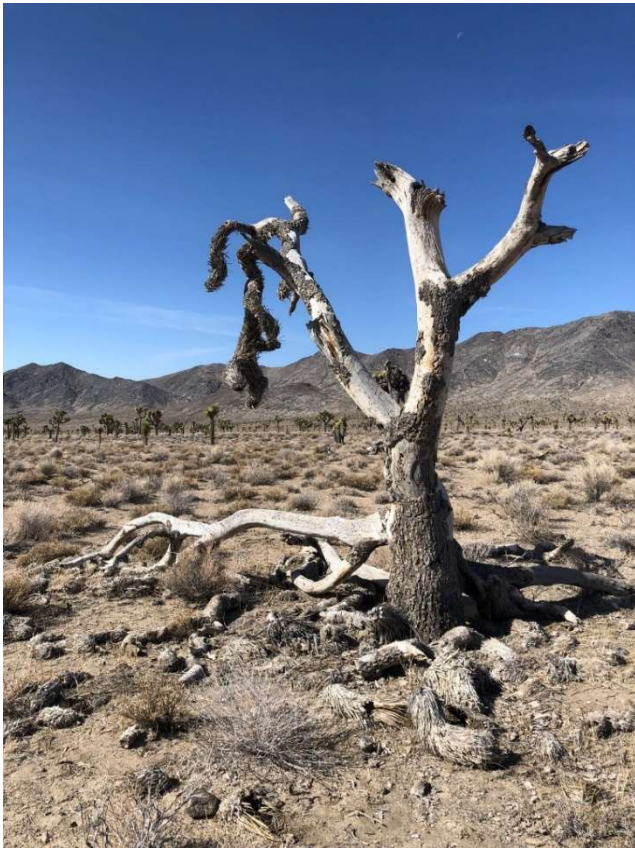
(Top) Recent damage and (bottom) mortality of western Joshua trees due to small mammal herbivory at Lee Flat, Death Valley National Park. Due to ongoing drought, many creatures have no choice but to eat Joshua tree periderm to survive.

final vote is scheduled to take place during the October FGC meeting, and it is expected there will be some discussion about a conservation plan for the species in lieu of listing. In the meantime, the comment period has been reopened to incorporate additional tribal outreach and consultation into the record.