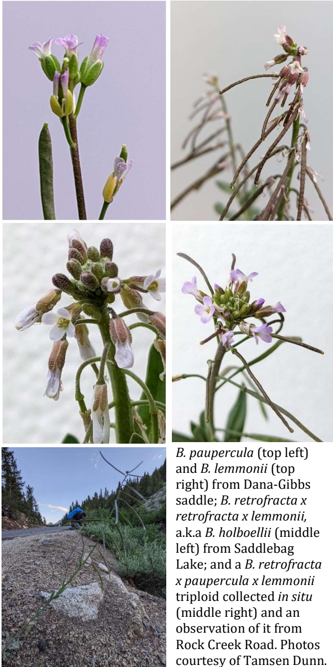
B. paupercula (top left) and B. lemmonii (top right) from Dana-Gibbs saddle; B. retrofracta x retrofracta x lemmonii, a.k.a B. holboellii (middle left) from Saddlebag Lake; and a B. retrofracta x paupercula x lemmonii triploid collected in situ (middle right) and an observation of it from Rock Creek Road.

Genetic analysis is ongoing. However, morphological review confirms that the novel triploid exists in significant numbers at Red Peak Pass, Ottoway Lakes, Merced Peak, Saddlebag Lake, Gardisky Lake, Ruby Lake and along Rock Creek Road. For the next two years, I will be continuing genetic assessment of the collections, completing stress test assessments, expanding my field work, and performing a population analysis to elucidate the extent, origin and population dynamics of the (as yet unnamed) retrofracta x paupercula x lemmonii triploid.