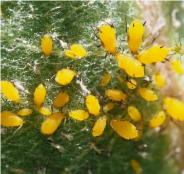
Aphis nerii on showy milkweed ( Asclepias speciosa ).