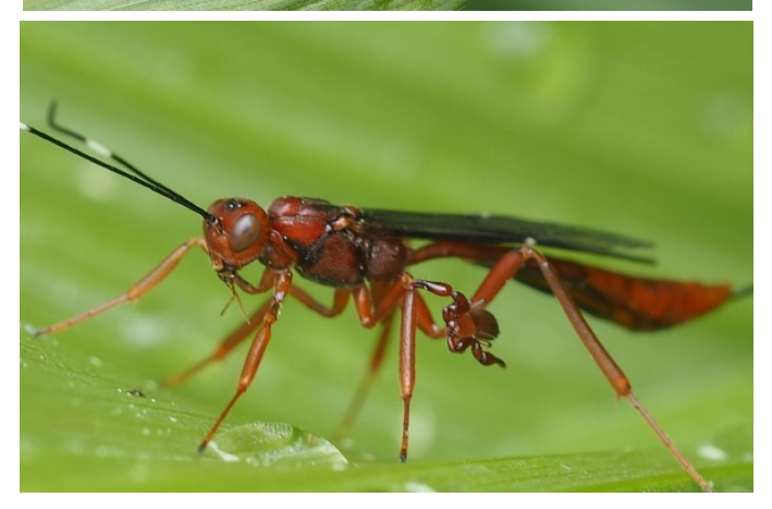
Top to Bottom: A pacific chorus frog, mating damselflies, and a pseudoscorpion hitching a ride on an ichneumon wasp all while on the corn lily.