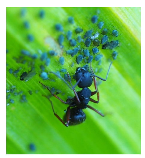
An ant interacting with aphids.

Flowering plants are more than nectaries. They provide a habitat for other organisms to interact. For example, the corn lily Veratrum californicum provides a place for animals to get food, rest, mate, and explore.