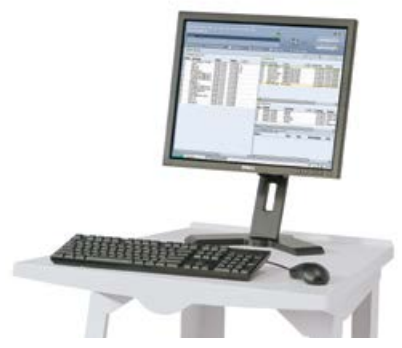
FreeFlow<sup>®</sup> Print Server