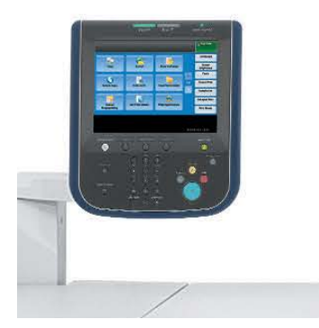
Integrated Copy/Print Server