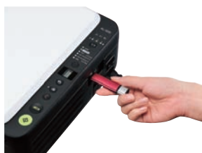
Scan to USB