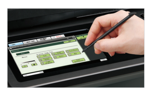
High-resolution touch-screen with stylus pen for easy point-and-touch operation.