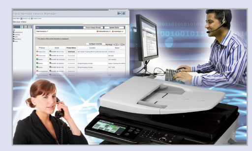
Sharp Remote Device Management.