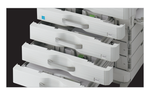
Available paper capacity stores up to 2,100 sheets with options.