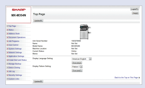
Embedded web page.