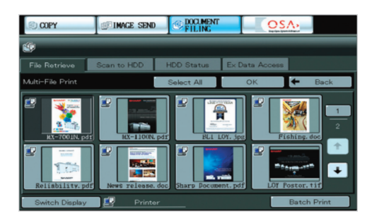
Sharp's easy-to-use document filing system with thumbnail preview.*