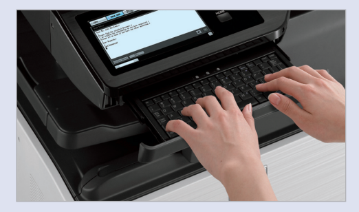
Easy-to-use optional, full-size, retractable QWERTY keyboard.