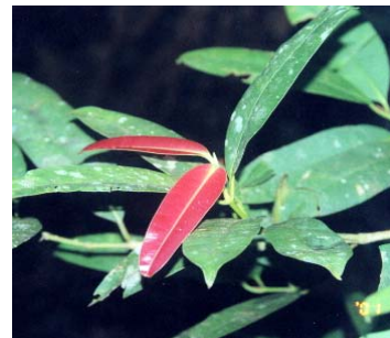
Callophyllum blancoi CLUSIACEAE Bitanghol Mt. Ginanlajan, Brgy. Lake Duminagat; Palo 6, Brgy. Mansawan - 1585-1650 masl Endemic