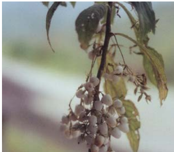
Cyrtandra umbellifera GESNERIACEAE Lalago pino Palo 6, Brgy. Mansawan 1585-1650 masl