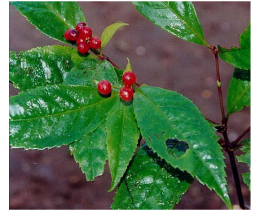
Sarcandra glabra CHLORANTHACEAE Babakag Palo 6, Brgy. Mansawan 1615-1625 masl Medicinal