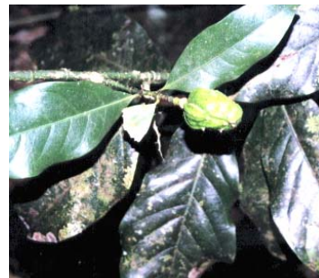
Talauma reticulata MAGNOLIACEAE Bunot-bunot Mt. Ginanlajan, Brgy. Lake Duminagat; Palo 6, Brgy. Mansawan - 1585-1650 masl Endemic