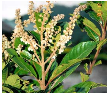
Clethra lancifolia CLETHRACEAE Sakam Mt. Ginanlajan, Brgy. Lake Duminagat; Palo 6, Brgy. Mansawan - 1585-1650 masl Widespread