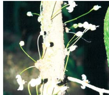
Saurauia fasciculiflora SAURAUACEAE Balangog lagwis Mt. Ginanlajan, Brgy. Lake Duminagat; Palo 6, Brgy. Mansawan - 1585-1625 masl Site Endemic (Palawan)