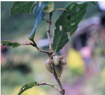
Cyrtandra parvifolia GESNERIACEAE Pure salisip Palo 6, Brgy. Mansawan 1605-1625 masl