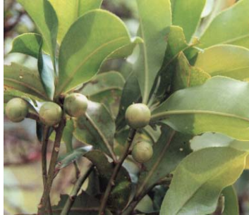
Gordonia luzonica THEACEAE Sabon-sabon Mt. Ginanlajan, Brgy. Lake Duminagat; Palo 6, Brgy. Mansawan - 1585-1625 masl Widespread