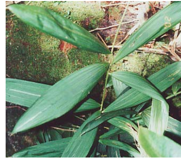
Calamus ornatus ARECACEAE Oway Palo 6, Brgy. Mansawan 1610-1620 masl