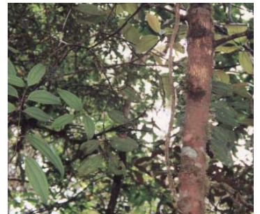
Cinnamomum mercadoi LAURACEAE Kalingag Mt. Ginanlajan, Brgy. Lake Duminagat; Palo 6, Brgy. Mansawan - 1585-1650 masl Widespread