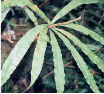
Oleandra nitida OLEANDRACEAE Kaliskis halas Palo 6, Brgy. Mansawan 1605-1625 masl