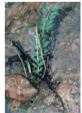
Dendrobium sp. ORCHIDACEAE Salapid Palo 6, Brgy. Mansawan 1600-1630 masl Ornamental