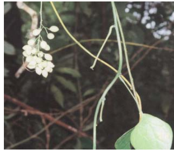
Dioscorea sp. DIOSCOREACEAE Magulemon Mt. Ginanlajan, Brgy. Lake Duminagat - 1605-1625 masl Medicinal