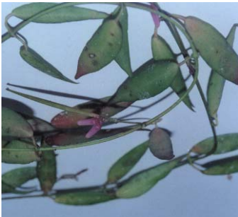
Dischidia lancifolia ASCLEPIADACEAE Christmas tree Mt. Ginanlajan, Brgy. Lake Duminagat - 1605-1625 masl Widespread