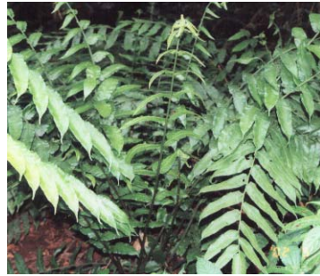
Diplaziopsis javanica ATHYRIACEAE Butitay Palo 6, Brgy. Mansawan 1615-1625 masl Food plant