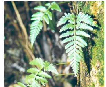
Humata obtusata DAVALLIACEAE Serelak Mt. Ginanlajan, Brgy. Lake Duminagat; Palo 6, Brgy. Mansawan - 1605-1625 masl