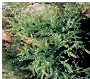
Camptochaeta subporotrichoides LEMBOPHYLLACEAE Mt. Ginanlajan, Brgy. Lake Duminagat - 1620 masl