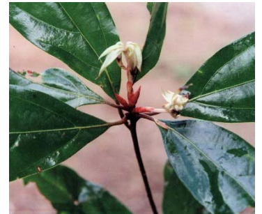
Neolitsea vidalii LAURACEAE Magamatong Mt. Ginanlajan, Brgy. Lake Duminagat; Palo 6, Brgy. Mansawan - 1585-1650 masl