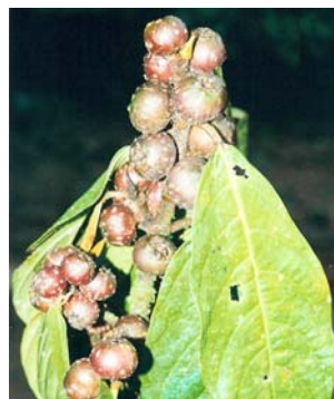
Ficus sp. MORACEAE Mt. Ginanlajan, Brgy. Lake Duminagat; Palo 6, Brgy. Mansawan - 1600-1630 masl Used in farming