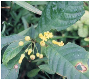
Dichroa philippinensis SAXIFRAGACEAE Mote-mote Mt. Ginanlajan, Brgy. Lake Duminagat; Palo 6, Brgy. Mansawan - 1605-1625 masl