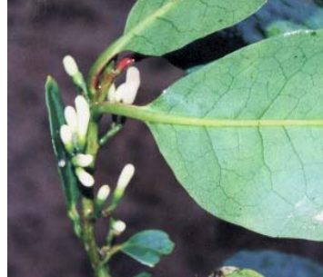
Pyrenaria mindanaensis THEACEAE Darikpol Palo 6, Brgy. Mansawan 1585-1625 masl Island Endemic (Mindanao)