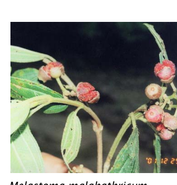
Melastoma malabathricum MELASTOMACEAE Malatungau Mt. Ginanlajan, Brgy. Lake Duminagat - 1605-1625 masl Medicinal