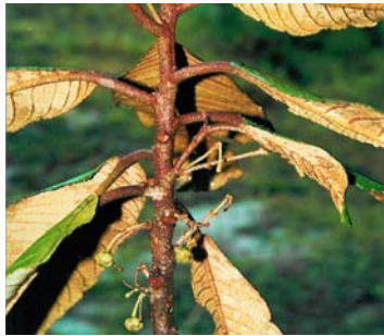
Saurauia elegans SAURAUACEAE Balangog dako Mt. Ginanlajan, Brgy. Lake Duminagat - 1585-1625 masl Widespread