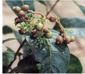
Sapium luzonicum EUPHORBIACEAE Baho-baho Mt. Ginanlajan, Brgy. Lake Duminagat; Palo 6, Brgy. Mansawan - 1585-1625 masl Widespread