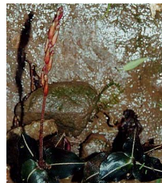
Habenaria sp. ORCHIDACEAE Mt. Ginanlajan, Brgy. Lake Duminagat - 1600-1625 masl Used during courtship, For personal charm