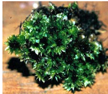
Bryum russulum BRYACEAE Mt. Ginanlajan, Brgy. Lake Duminagat - 1630 masl