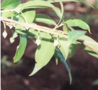
Adinandra montana THEACEAE Tabantis Mt. Ginanlajan, Brgy. Lake Duminagat; Palo 6, Brgy. Mansawan - 1585-1625 masl Widespread