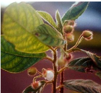
Saurauia involucrata SAURAUACEAE Balangog balhibo-on Mt. Ginanlajan, Brgy. Lake Duminagat; Palo 6, Brgy. Mansawan - 1605-1625 masl Site Endemic (Davao)