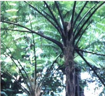
Cyathea contaminans CYATHEACEAE Gantaw Mt. Ginanlajan, Brgy. Lake Duminagat; Palo 6, Brgy. Mansawan - 1585-1625 masl Medicinal, Food plant