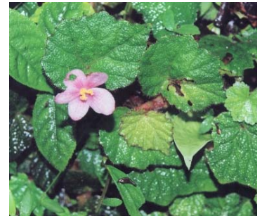
Begonia copelandii BEGONIACEAE Mamangpang Palo 6, Brgy. Mansawan 1615 masl Widespread