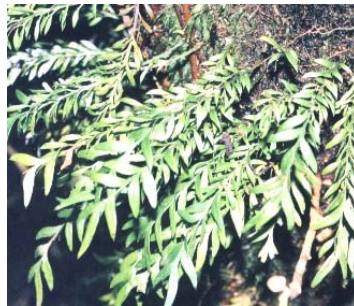
Tmesipteris lanceolata PSILOTAECIAE Mt. Ginanlajan, Brgy. Lake Duminagat; Palo 6, Brgy. Mansawan - 1600-1620 masl