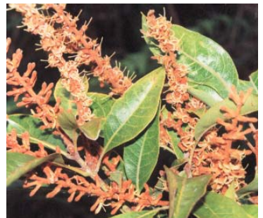
Symplocos villarii SYMPLOCACEAE Lanutan Mt. Ginanlajan, Brgy. Lake Duminagat - 1585-1625 masl Widespread