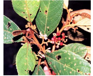
Callicarpa eriocloma VERBENACEAE Mt. Ginanlajan, Brgy. Lake Duminagat; Palo 6, Brgy. Mansawan - 1600-1630 masl Medicinal