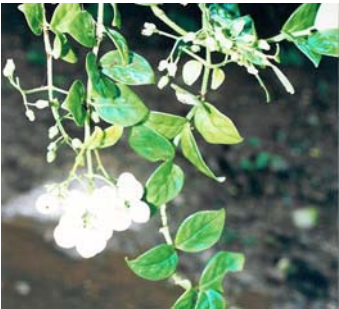
Psychotria diffusa RUBIACEAE Bagun Mt. Ginanlajan, Brgy. Lake Duminagat; Palo 6, Brgy. Mansawan - 1585-1615 masl Widespread