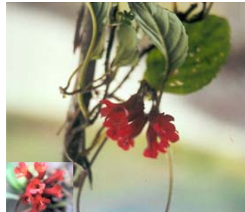
Agalmyla sp. GESNERIACEAE Palo 6, Brgy. Mansawan 1605-1625 masl Widespread