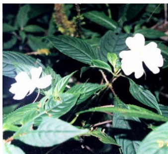
Impatiens montalbanica BALSAMINACEAE Silangka Mt. Ginanlajan, Brgy. Lake Duminagat; Palo 6, Brgy. Mansawan - 1600-1615 masl Used in giving birth