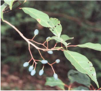
Elaeocarpus calomala ELAEocarPACEAE Babate Mt. Ginanlajan, Brgy. Lake Duminagat; Palo 6, Brgy. Mansawan - 1585-1625 masl Island Endemic (Luzon)