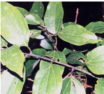
Cinnamomum mindanaense LAURACEAE Mana-mana Mt. Ginanlajan, Brgy. Lake Duminagat; Palo 6, Brgy. Mansawan - 1585-1650 masl Island Endemic (Mindanao)