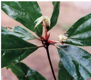
Neolitsea vidalii LAURACEAE Magamatong Mt. Ginanlajan, Brgy. Lake Duminagat; Palo 6, Brgy. Mansawan - 1585-1650 masl Widespread