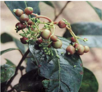
Sapium luzonicum EUPHORBIACEAE Baho-baho Mt. Ginanlajan, Brgy. Lake Duminagat; Palo 6, Brgy. Mansawan - 1585-1625 masl