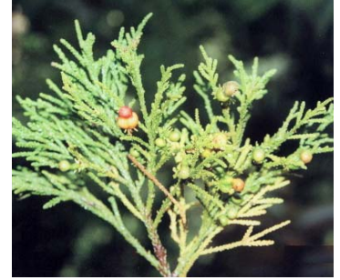
Dacrycarpus cumingii PODOCARPACEAE Pine tree Mt. Ginanlajan, Brgy. Lake Duminagat; Palo 6, Brgy. Mansawan - 1585-1625 masl