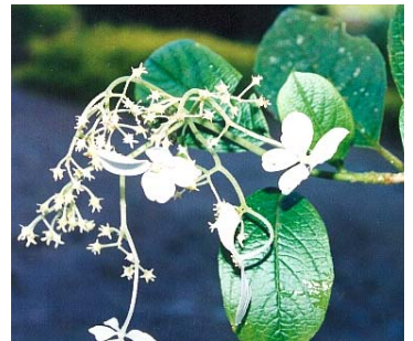
Hydrangea chinensis HYDRANGEACEAE Salisip Mt. Ginanlajan, Brgy. Lake Duminagat - 1600-1615 masl Medicinal