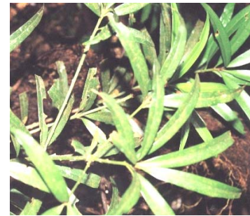
Podocarpus neriifolius PODOCARPACEAE Subing diwata Mt. Ginanlajan, Brgy. Lake Duminagat - 1585-1650 masl Lumber