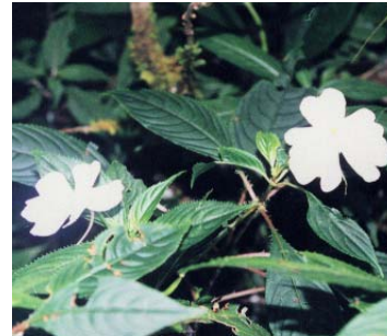
Impatiens montalbanica BALSAMINACEAE Silangka Mt. Ginanlajan, Brgy. Lake Duminagat; Palo 6, Brgy. Mansawan - 1605-1625 masl Site Endemic (Rizal)