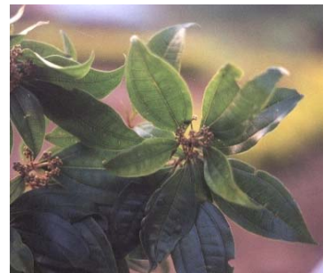
Astronia cumingiana MELASTOMATACEAE Hantutungaw Mt. Ginanlajan, Brgy. Lake Duminagat; Palo 6, Brgy. Mansawan - 1615-1625 masl Widespread