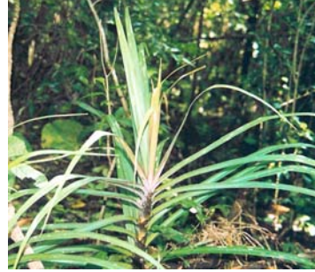
Freycinetia negrosensis PANDANACEAE Bara-as Mt. Ginanlajan, Brgy. Lake Duminagat; Palo 6, Brgy. Mansawan - 1615-1625 masl Widespread