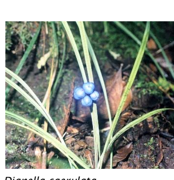
Dianella caerulea LILIACEAE Limbas-limbas Mt. Ginanlajan, Brgy. Lake Duminagat; Palo 6, Brgy. Mansawan - 1605-1625 masl Ornamental