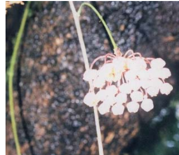
Hoya sp. ASCLEPIADACEAE Christmas tree Palo 6, Brgy. Mansawan 1615-1625 masl Ornamental