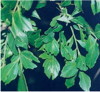
Phyllocladus hypophyllus PODOCARPACEAE Tungog Mt. Ginanlajan, Brgy. Lake Duminagat; Palo 6, Brgy. Mansawan - 1585-1650 masl Lumber