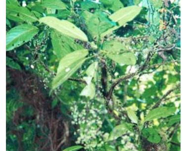
Dendrocide densiflora URTICACEAE Lingatong punay Mt. Ginanlajan, Brgy. Lake Duminagat; Palo 6, Brgy. Mansawan - 1605-1625 masl