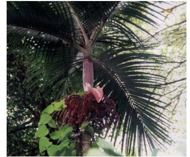
Pinanga philippinensis ARECACEAE Karupay Mt. Ginanlajan, Brgy. Lake Duminagat; Palo 6, Brgy. Mansawan - 1585-1650 masl Widespread