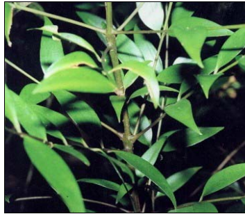
Agathis philippinensis ARAUCARIACEAE Dingan Mt. Ginanlajan, Brgy. Lake Duminagat; Palo 6, Brgy. Mansawan - 1585-1625 masl