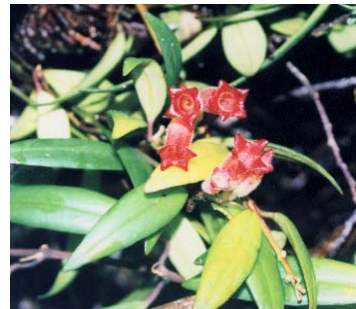
Aeschynanthus sp. GESNERIACEAE Christmas tree Mt. Ginanlajan, Brgy. Lake Duminagat - 1605-1625 masl Ornamental