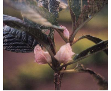
Cyrtandra cumingii GESNERIACEAE Lalago dako Palo 6, Brgy. Mansawan 1605-1625 masl Widespread