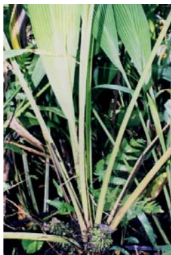
Molinaria capitulata HYPOXIDACEAE Karrot Mt. Ginanlajan, Brgy. Lake Duminagat 1605-1625 masl Ornamental, Food plant