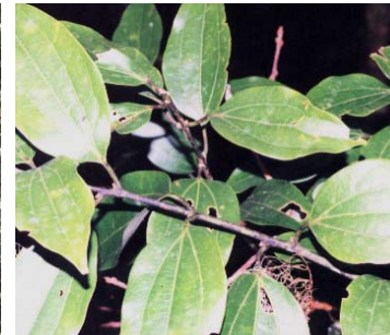
Cinnamomum mindanaense LAURACEAE Mana-mana Mt. Ginanlajan, Brgy. Lake Duminagat; Palo 6, Brgy. Mansawan - 1585-1650 masl