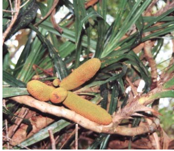
Freycinetia multiflora PANDANACEAE Pandán Mt. Ginanlajan, Brgy. Lake Duminagat - 1615-1625 masl Widespread