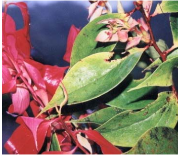
Vaccinium jagori ERICACEAE Lalumaw Palo 6, Brgy. Mansawan 1605-1625 masl Island Endemic (Luzon)