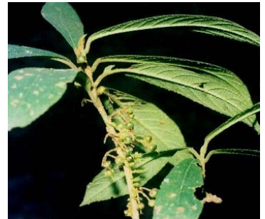
Saurauia glabrifolia SAURAUACEAE Balangog di balhibo-on Mt. Ginanlajan, Brgy. Lake Duminagat - 1585-1625 masl Site Endemic (Surigao)