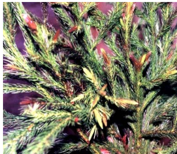
Dacrydium elatum PODOCARPACEAE Lomot Palo 6, Brgy. Mansawan 1585-1650 masl Lumber