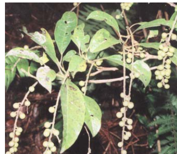
Polyosma philippinensis SAXIFRAGACEAE Babasa Mt. Ginanlajan, Brgy. Lake Duminagat; Palo 6, Brgy. Mansawan - 1585-1625 masl Widespread