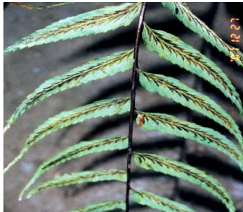
Asplenium militare ASPENIACEAE Palo 6, Brgy. Mansawan 1615 masl