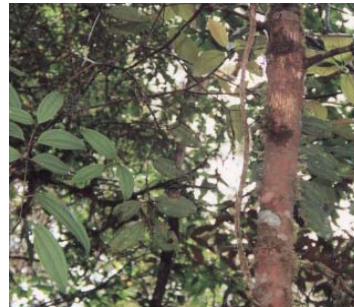
Cinnamomum mercadoi LAURACEAE Kalingag Mt. Ginanlajan, Brgy. Lake Duminagat; Palo 6, Brgy. Mansawan - 1585-1650 masl