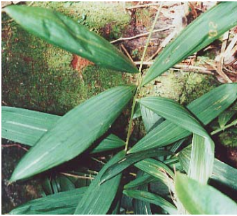
Calamus ornatus ARECACEAE Oway Palo 6, Brgy. Mansawan 1610-1620 masl Raw material for handicraft