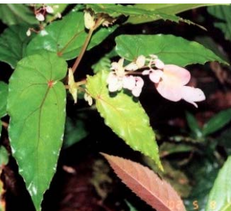
Begonia cumingii BEGONIACEAE Mamangpang Mt. Ginanlajan, Brgy. Lake Duminagat; Palo 6, Brgy. Mansawan - 1605-1625 masl Island Endemic (Luzon)