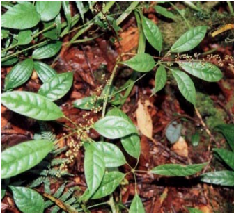
Schefflera odorata ARALIACEAE Tagima Mt. Ginanlajan, Brgy. Lake Duminagat; Palo 6, Brgy. Mansawan - 1585-1650 masl Widespread