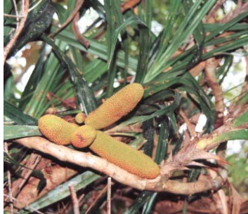
Freycinetia multiflora PANDANACEAE Pandan Mt. Ginanlajan, Brgy. Lake Duminagat - 1615-1625 masl Widespread