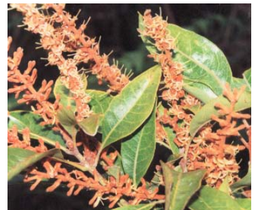
Symplocos villarii SYMPLOCACEAE Lanutan Mt. Ginanlajan, Brgy. Lake Duminagat - 1585-1625 masl Widespread