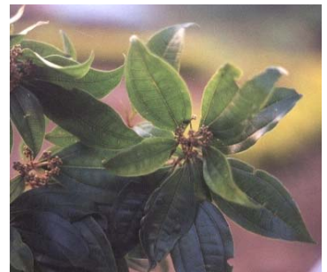
Astronia cumingiana MELASTOMACEAE Hantutungaw Mt. Ginanlajan, Brgy. Lake Duminagat; Palo 6, Brgy. Mansawan - 1615-1625 masl Widespread