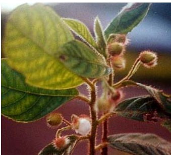
Saurauia involocrata SAURAUACEAE Balangog balhibo-on Mt. Ginanlajan, Brgy. Lake Duminagat; Palo 6, Brgy. Mansawan - 1605-1625 masl Site Endemic (Davao)