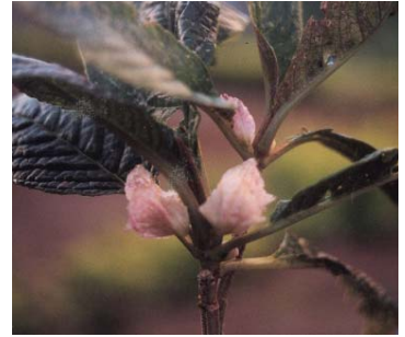
Cyrtandra cumingii GESNERIACEAE Lalago dako Palo 6, Brgy. Mansawan 1605-1625 masl Widespread