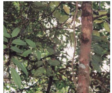
Cinnamomum mercadoi LAURACEAE Kalingag Mt. Ginanlajan, Brgy. Lake Duminagat; Palo 6, Brgy. Mansawan - 1585-1650 masl Widespread