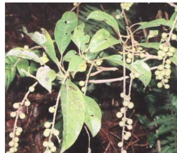
Polyosma philippinensis SAXIFRAGACEAE Babasa Mt. Ginanlajan, Brgy. Lake Duminagat; Palo 6, Brgy. Mansawan - 1585-1625 masl Widespread