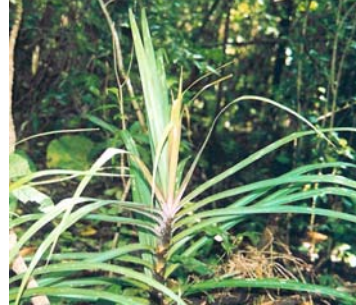
Freycinetia negrosensis PANDANACEAE Bara-as Mt. Ginanlajan, Brgy. Lake Duminagat; Palo 6, Brgy. Mansawan - 1615-1625 masl Widespread