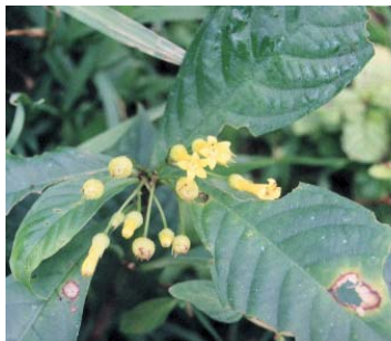
Dichroa philippinensis SAXIFRAGACEAE Mote-mote Mt. Ginanlajan, Brgy. Lake Duminagat; Palo 6, Brgy. Mansawan - 1605-1625 masl