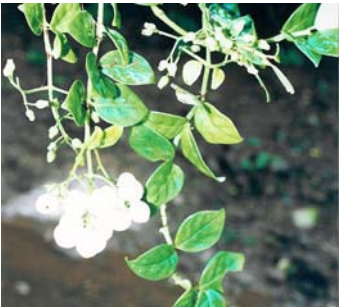
Psychotria diffusa RUBIACEAE Bagun Mt. Ginanlajan, Brgy. Lake Duminagat; Palo 6, Brgy. Mansawan - 1585-1615 masl Widespread