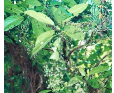
Dendrocnide densiflora URTICACEAE Lingatong punay Mt. Ginanlajan, Brgy. Lake Duminagat; Palo 6, Brgy. Mansawan - 1605-1625 masl