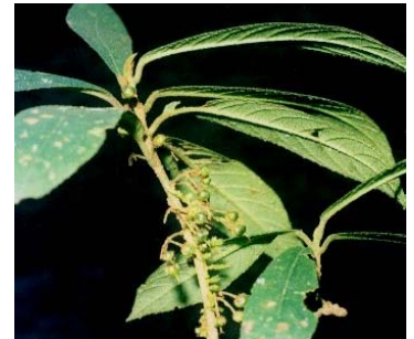
Saurauia glabrifolia SAURAUACEAE Balangog di balhibo-on Mt. Ginanlajan, Brgy. Lake Duminagat - 1585-1625 masl Site Endemic (Surigao)