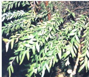
Tmesipteris lanceolata PSILOTACEAE Mt. Ginanlajan, Brgy. Lake Duminagat; Palo 6, Brgy. Mansawan - 1600-1620 masl