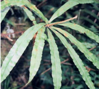
Oleandra nitida OLEANDRACEAE Kaliskis halas Palo 6, Brgy. Mansawan 1605-1625 masl