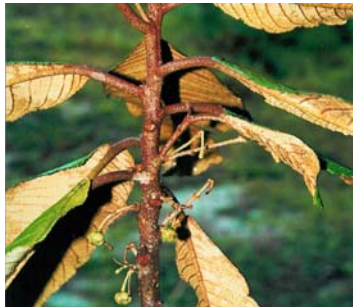
Saurauia elegans SAURAUACEAE Balangog dako Mt. Ginanlajan, Brgy. Lake Duminagat - 1585-1625 masl Widespread