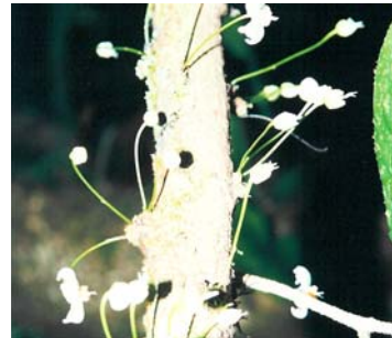
Saurauia fasciculiflora SAURAUACEAE Balangog lagwis Mt. Ginanlajan, Brgy. Lake Duminagat; Palo 6, Brgy. Mansawan - 1585-1625 masl Site Endemic (Palawan)