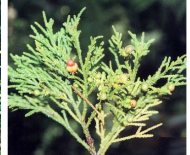
Dacrycarpus cumingii PODOCARPACEAE Pine tree Mt. Ginanlajan, Brgy. Lake Duminagat; Palo 6, Brgy. Mansawan - 1585-1625 masl