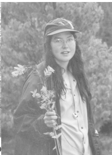
Me (right) and field site in northern Alberta (above)