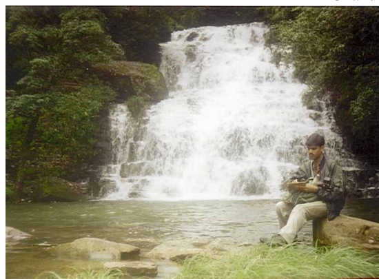
Elephant falls (right) is the most scenic and bryologically interesting site at Shillong in the Khasi hills of Meghalaya state.

The main objective of this study is to make critical and comprehensive studies of bryodiversity among liverworts and hornworts of Khasi and Jaintia Hills. A complete account of liverworts, with distribution maps, illustrations, habitat relationships, assessment of rare and threatened taxa, and the factors responsible for the depletion of important taxa from their original sites will be compiled. Ultrastructural studies are being carried out in order to understand significant details regarding phylogeny.