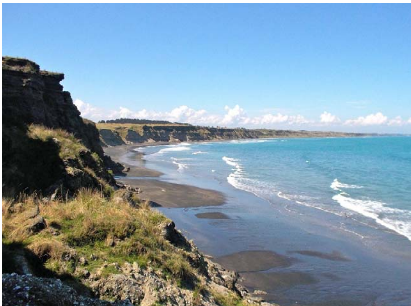
Nukumaru Bay, one of several fossil bryozoan sites in the Whanganui Basin with breathtaking coastal scenery.