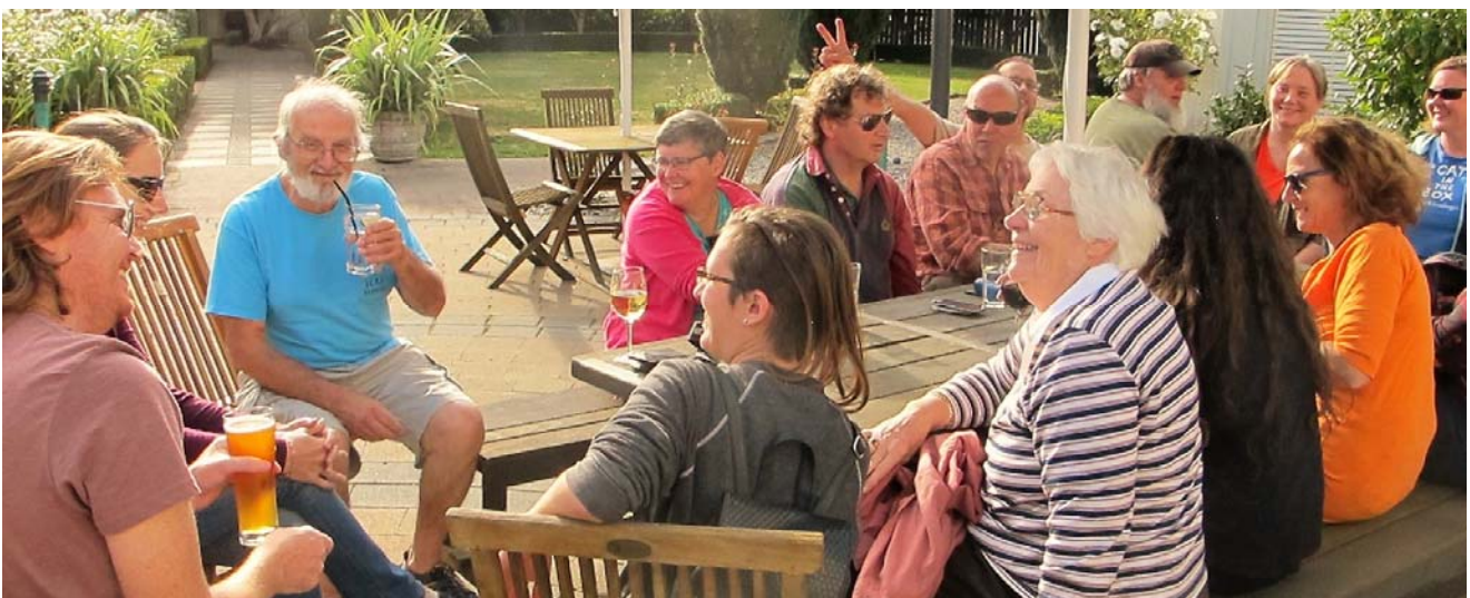
Top left – bryozoologists at Rivendell. Top right – Late Miocene bryozoans at Kupe’s Sail. Bottom – end of tour unwinding at the Martinborough Hotel