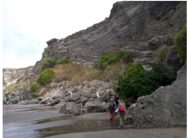
Left - Shell of Ostrea chilensis from the Nukumaru Limestone encrusted by numerous interacting cheilostome and cyclostome bryozoans, as well as the odd barnacle. Right - Cliff of cross-bedded Early Pleistocene Nukumaru Limestone, western end of Nukumaru Beach, New Zealand.