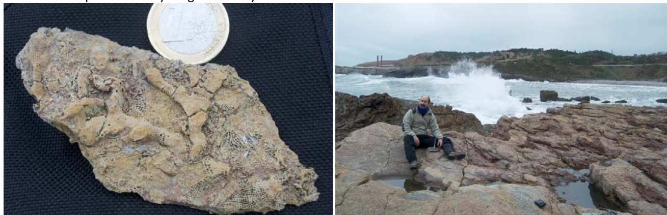
Photo 1. Trepostome bryozoan from the Aguión Formation showing abundant pores corresponding to endobiont apertures (left), with Bigeyina ibera (right) and other fenestrates. Photo 2. A view of the Emsian outcrop of Aguión Formation at Arnao with the low tide; the cliffs at the background correspond to the Emsian-Eifelian Moniello Formation, also rich in bryozoans.