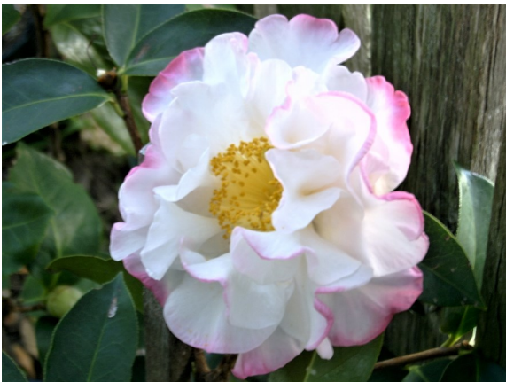
C. reticulata hybrid - 'Lady Pamela'