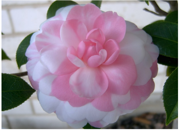
C. x williamsii - 'E. G. Waterhouse Variegated'