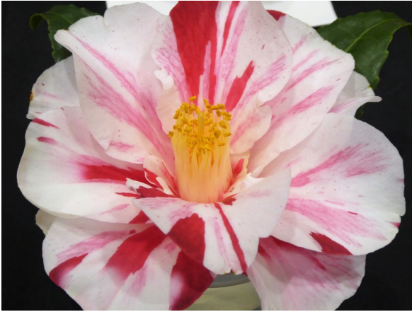
C. japonica - 'Courtesan'