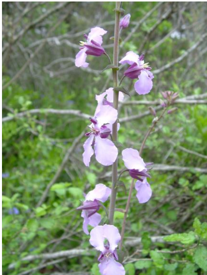
Bracted twistflower ( Streptanthus bracteatus ), an Edwards Plateau endemic