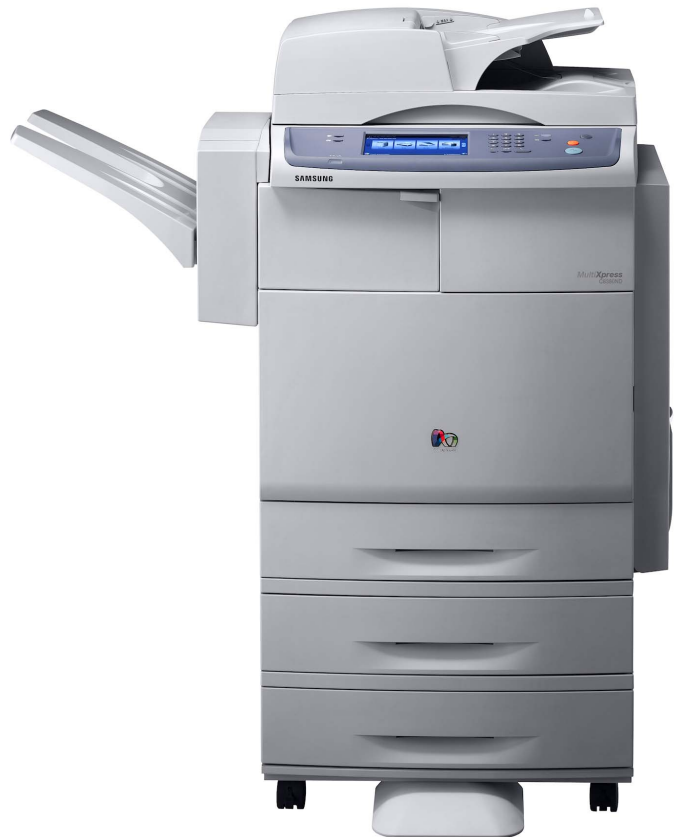
Samsung MultiXpress C8380ND

Samsung Electronics Co., Ltd. is a global leader in semiconductor, telecommunication, digital media and digital convergence technologies with 2007 consolidated sales of $103.4 billion. Employing approximately 150,000 people in 134 offices in 62 countries, the company consists of five main business units: Digital Media Business, LCD Business, Semiconductor Business, Telecommunication Business and Digital Appliance Business. Recognized as one of the fastest growing global brands, Samsung Electronics is a leading producer of digital TVs, memory chips, mobile phones and TFT-LCDs. For more information, please visit www.samsung.com .