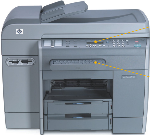
4-line LCD displays email addressing