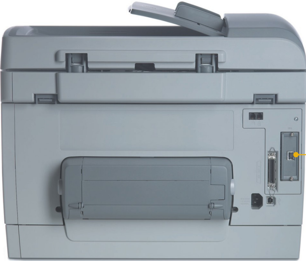
HP Jetdirect print server