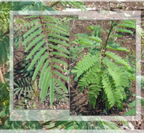
Figure 2. Leaves of L. diversifolia (left) and L. trichandra (right), visualising the morphological differences between the two species.

Main morphological differences between the two species L. diversifolia and L. trichandra are length and width of the pinnules and number of pinnules/pinna, both being distinctly lower for L. trichandra (see figure 2).