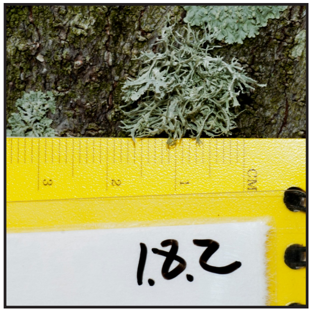
Plate 4 - This shows the 2-3-2 code and measurements for a specimen. The ruler is used to measure overall thalli length/height and size of distinct features.

Munn Park of the downtown Lakeland area yeilded the worst results of all three plots surveyed. Unhealthy crustose lichens were the dominant species present, with very few foliose. No fruiticose lichens of any kind were found (keeping in mind that this study does not include a canopy assessment). The findings at Munn Park consisted of lichen with severe discoloration (plate 5), shrunken