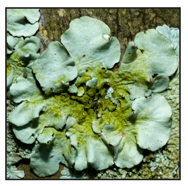
Plate 2 - This is an example of a foliose lichen. It has a leaf-like thallus and is attached to the substrate by occasional stem-like rhizines.

Following the field surveys, each species was then identified using a North American lichen key with a stereomicroscope and/or photographs. Information regarding each species was entered into a table for each region, and a biodiversity index was formed.