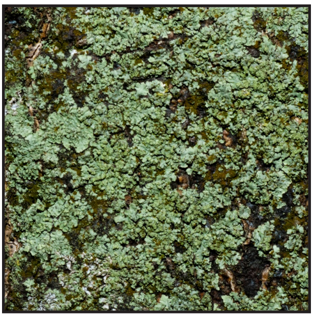
Plate 5 - This lichen is severely discolored compared to the same species in the other two plots due to the harsh effects of automobile emissions.