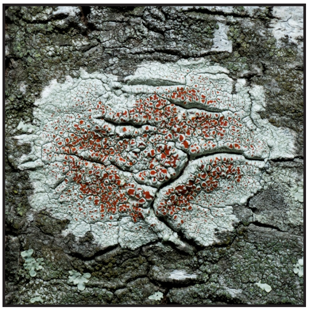
Plate 6 - This lichen has a shrunken thalli and much smaller reproductive structures compared to the same species found at FSC and LHS.

thalli (plate 6), smaller reproductive structures, and lack of species diversity. Only a total of 8 species were found in the Munn Park plot (table 3).