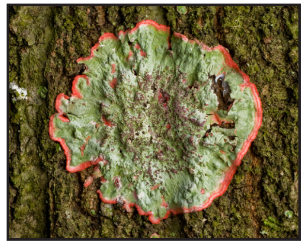
Plate 1 - Herpothallon rubrocinctum (Christmas Lichen) is a good example of a crustose lichen, growing either within or directly on the substrate in its entirety.

human activity (via automobile emissions) as "low-disturbance", "moderate-disturbance", and "high-disturbance". Surveyed trees within each site were selected at random according to species. Each tree assessed was at least 25cm in diameter at the base of the trunk and had colonized lichens present. Each tree surveyed was catalogued as a data point with a site specific ID using a Garmin eTrex Legend HCx GPS. Individual data points consisted of a 2-3-2 code, where each code denoted region, tree number, and individual species in respective order from left to right (plate 4).