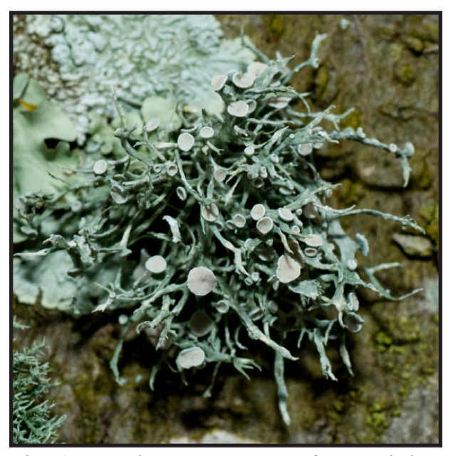
Plate 3 - Ramalina stenospora is a fruticose lichen. It is characterized by the fruiting bodies and raised structure coming off of the substrate.