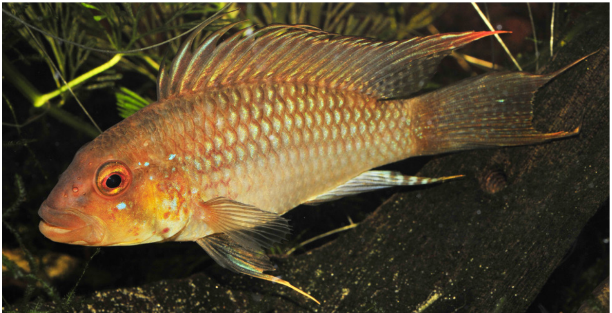
Fig. 10. Apistogramma megastoma sp. n., adult male; not preserved; coloration of dominant territorial male in neutral mood.

Less obviously, the colour of the teeth and adjacent epidermal tissue may be used as an additional character (taken from live photographs) to differentiate Apistogramma megastoma sp. n. from its congener A. barlowi : in most Apistogramma species this internal skin tissue is more or less uniformly whitish to light grey leaving the brownish (in most species) tips of the teeth visible. In species related to Apistogramma cactuoides HOEDEMAN, 1951 or A. nijsseni KULLANDER, 1979, which develop fleshy hypertrophied lips, the tooth rows are deeply embedded in fleshy skin tissue, which is, however, pushed aside dur-