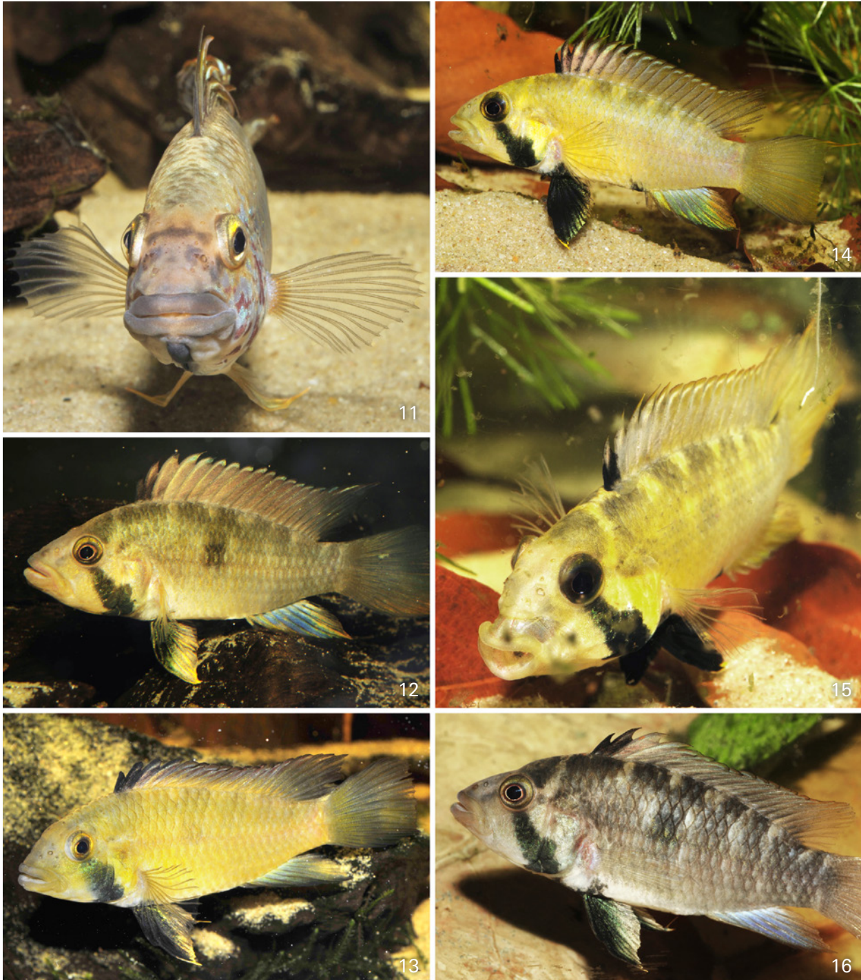
Fig. 11. Apistogramma megastoma sp. n., adult male; not preserved; typical head pattern of slightly aggressive dominant male, with pronounced interorbital stripe and grey lips.