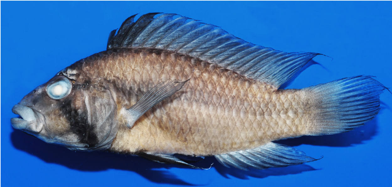
Fig. 1. Apistogramma megastoma sp. n., MUSM 52459, holotype, female, 61,9 mm SL; 6 months after preservation. December 2012.