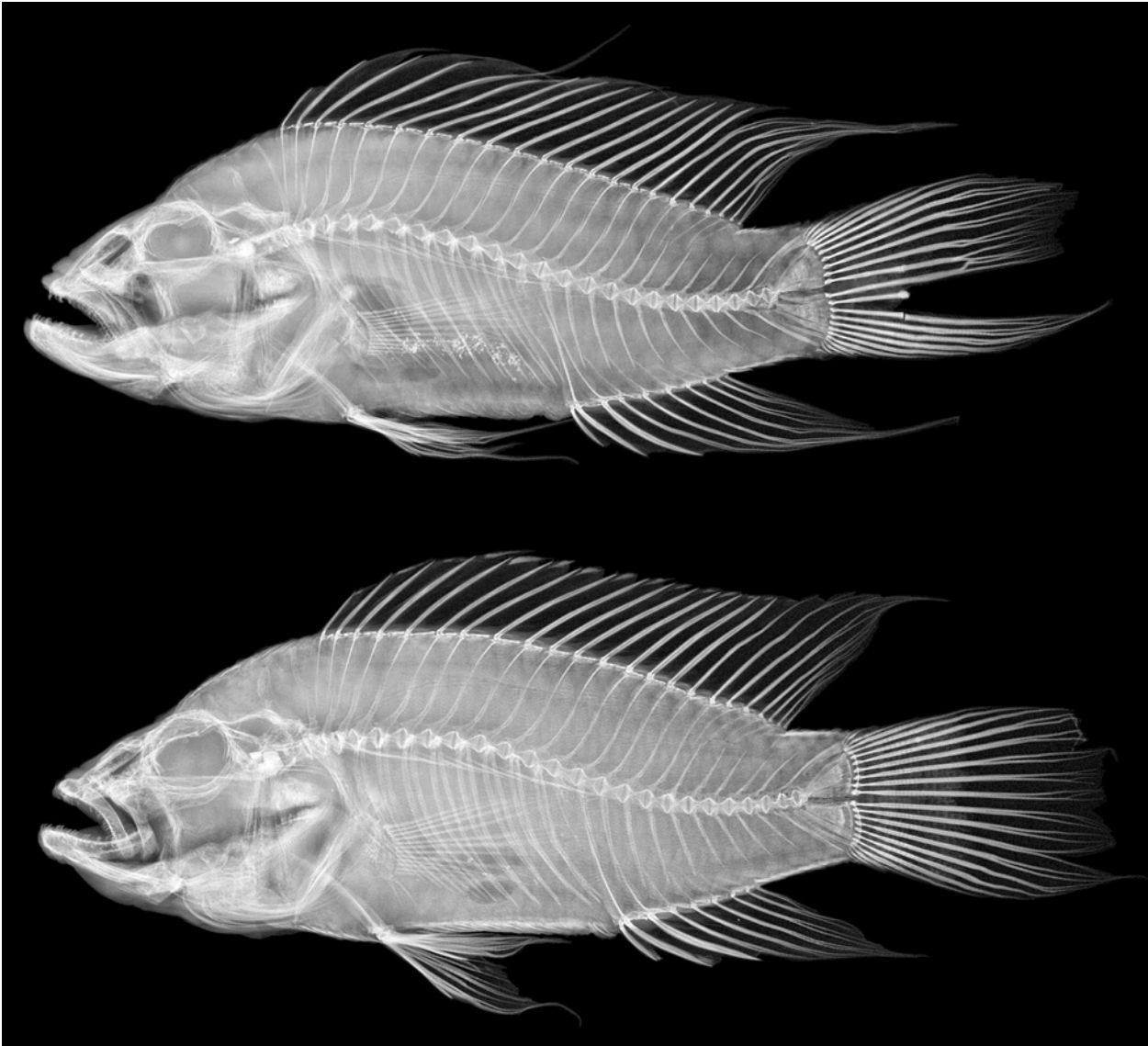
Fig. 5. Apistogramma megastoma sp. n., MUSM 52450 , male, 76.3 mm SL ( top ); MUSM 52451, female, 58.2 mm SL ( bottom ).

on exposed edge; margin about fifth to third width of visible part of scale along median horizontal line, broadest in mid-lateral scale rows, narrowest on anterior part of dorsum; in some specimens preserved for longer time light margin counter-shaded by dark brown submarginal line. Basic colour of lips, unscaled lower parts of cheeks, preoperculum, infraorbital, lower jaw, pectoral-fin base, and breast bluish white with numerous small grey, brown, or black chromatophores; significantly darker in largest specimens, giving dusky to dirty grey impression; anterior parts of lips generally darker than posterior. In some specimens distinct blackish interorbital stripe with widened oval to squarish centre and widened edges close to orbitals. Preorbital, scaled parts of cheeks, and operculum light greyish to brownish; operculum with more greyish area directly above black cheek stripe. Cheek (lachrymal) stripe in both sexes about pupil width at origin between foramina 1 and 2 of posterior orbital of suborbital series (for terminology see KULLANDER, 1987),