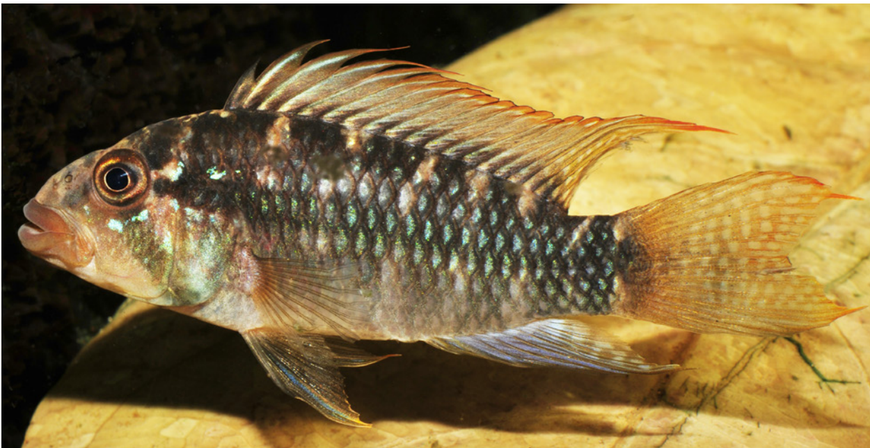
Fig. 8. Apistogramma megastoma sp. n., adult male; not preserved; vertical bars are visible only in subdominant males subordinated by aggressive dominant females.

large series of photographs of several females showing this colour pattern have revealed that these line-forming spots or dashes are positioned on the outer radius of the scales a short distance from their upper or lower edges. Female A. barlowi may also sometimes exhibit black spots generally reminiscent of those described here, but they never follow the scale edges as in Apistogramma megastoma sp. n., but are randomly distributed over the abdomen, never forming such regular lines. In females in a high state of aggression the ground colour changes from bright yellow to whitish yellow, with a pronounced