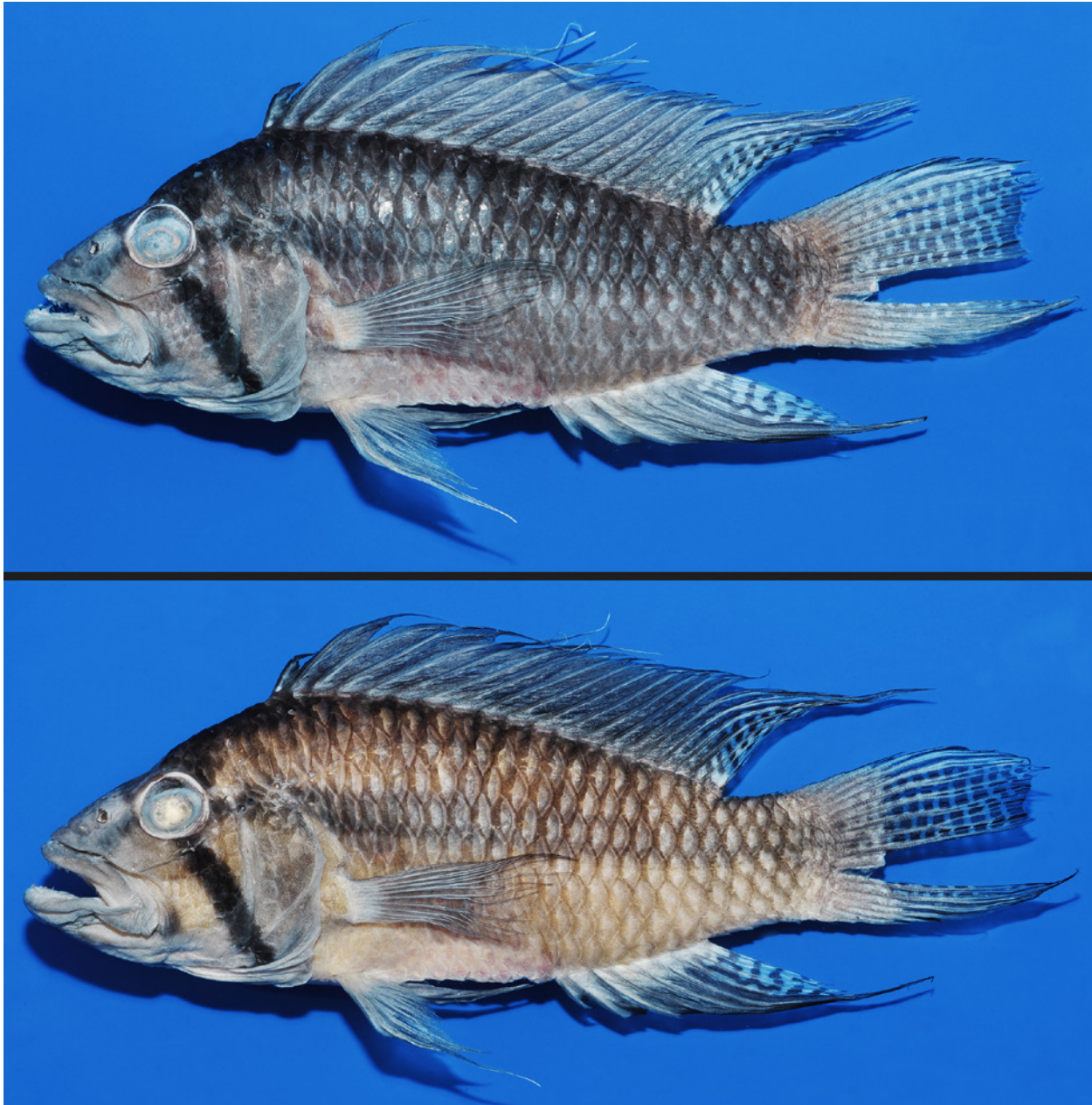
Fig. 2. Apistogramma megastoma sp. n., MUSM 52450 , paratype, male, 76.3 mm SL; top : 2 days after preservation, bottom : 6 months after preservation. December 2013.

caudal peduncle 21.6 to 51.6 % (mean 31.3 %) deeper than long, correlation of allometry strongly negative with increasing size (SL). Scales in median E1 row 21 to 23 [21 (n=9), 22 (n=6), 23 (n=1)]; 16 circumpeduncular scales (n=16). Lateral-line scales in series E4, E2, and E1, exceptionally some in E3, counts ranging from 13 to 16/ 0 to 3 / 4 to 8, with frequencies as follows: 13/1/7 (1), 13/2/6 (1), 13/2/8 (1), 14/0/6 (1), 14/0/7 (1), 15/1/5 (1), 15/1/8 (1), 15/2/4 (1), 15/2/6 (1), 15/2/7 (1), 15/3/8 (1), 16/1/6 (1) (3 IIAP- and 3 MUSM-specimens not included). Vertebrae 11 + 11 = 24 (7), 11 + 12 = 23 (3), 12 + 12 = 24 (1), 12 + 13 = 25 (1) 2 (fig. 5). Jaw teeth unicuspid, erect, cusp strongly recurved; teeth of outer row significantly larger than inner row in males, in females only slightly larger or similar in size.