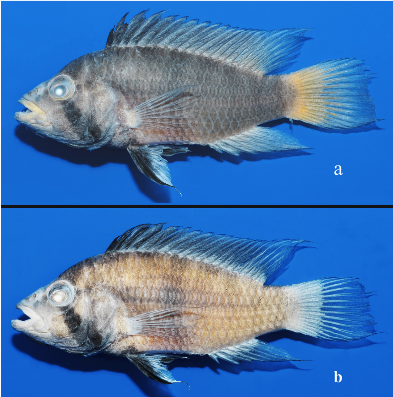
Fig. 3. Apistogramma megastoma sp. n., MUSM 52451 , paratype, female, 58.2 mm SL; top : 2 days after preservation, bottom : 6 months after preservation. December 2013.