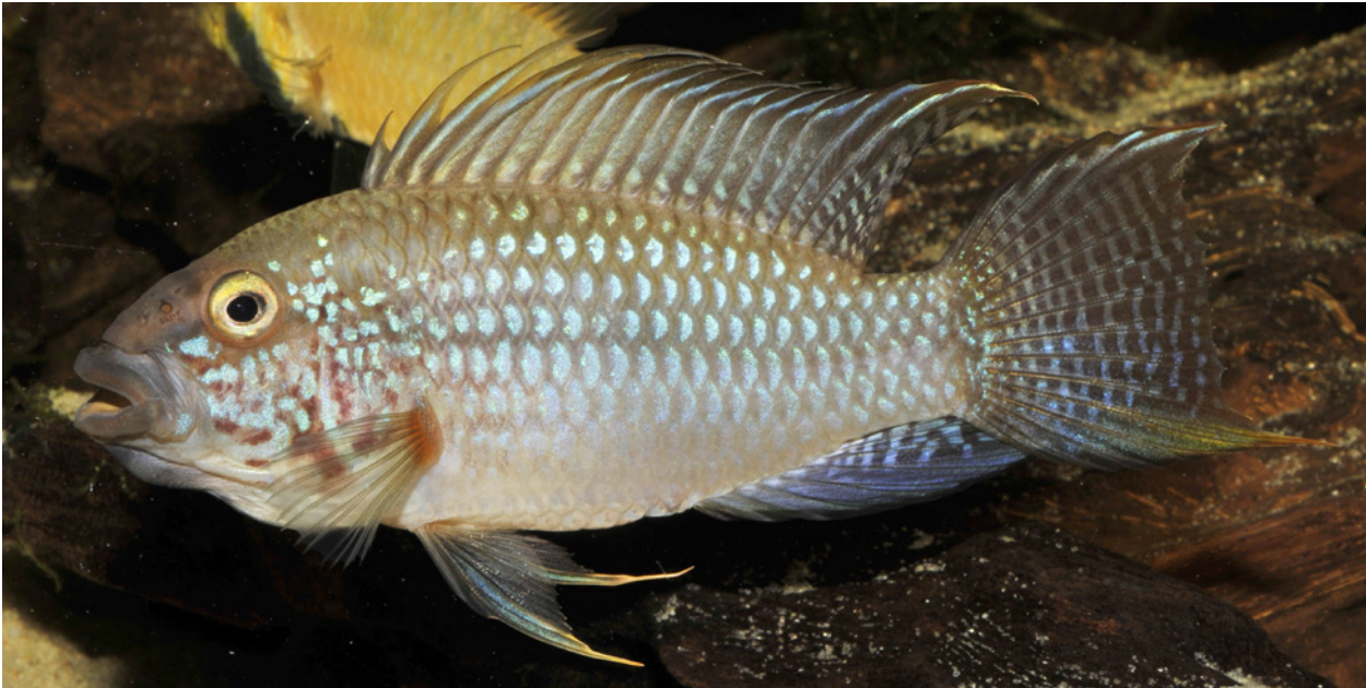
Fig. 7. Apistogramma megastoma sp. n., adult male; not preserved; coloration while aggressively displaying to mouth-brooding female (behind).