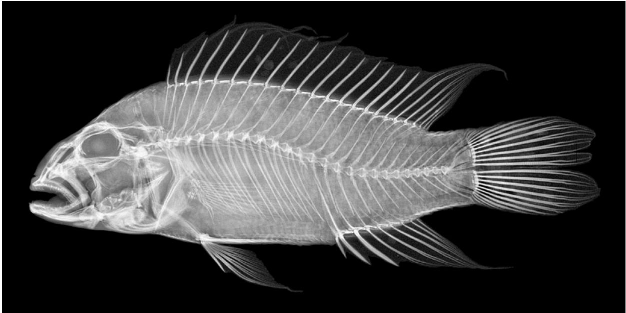
Fig. 6. For comparison: Apistogramma barlowi , MUSM 52455, male, 59.2 mm SL. Digital x-ray: L. Fels, N. Leiwes, & C. Mühle.