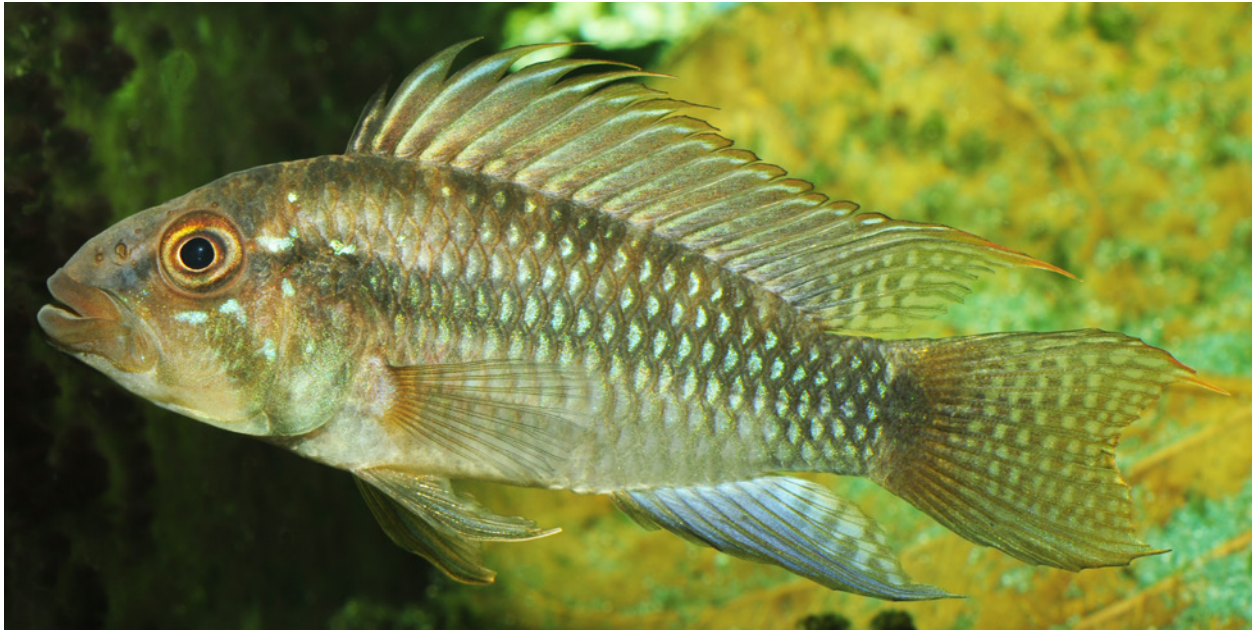
Fig. 9. Apistogramma megastoma sp. n., adult male; not preserved; coloration of non-territorial subdominant male in neutral mood.